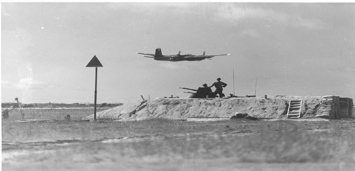
A B-26 light bomber takes to the sky on another Operation Strangle mission against Communist targets in Korea as an anti-aircraft crew watches. The entire doctrine effort after 1953 was influenced by the fact that airpower had not done very well in Korea in light of what it promised and could not deliver. Operation Strangle is the most notorious example of that failure.

war over, they asserted correctly, based on the evidence, that Allied airpower was decisive in the war in Western Europe. 60