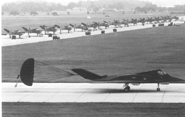
The Gulf War brought to the fore the technology, tactics, techniques, and operational methods on which the Air Force had been working since the Vietnam War. Technology helped to win the fastest, lowest casualty, most devastatingly destructive one-sided war in recorded history. Air Force capabilities had come of age.