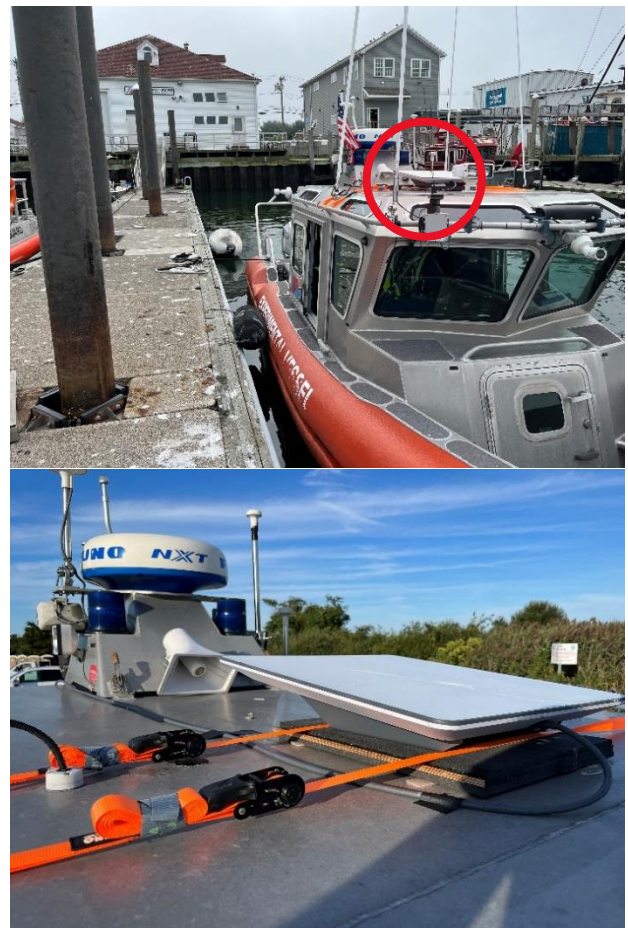
Figure 3. Starlink antenna installed on the RDC’s RB-S (Source: U.S. Coast Guard).

The third and final test event occurred over a week in September of 2023 and consisted of mounting the system on the RDC’s 25 foot Response Boat-Small (RB-S) (Figure 3) and running the boat at various speeds in a seaway, while constantly gathering latency and throughput data.