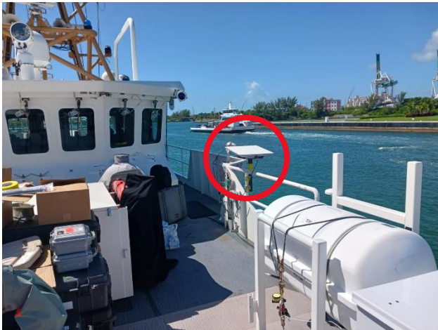
Figure 2. Starlink installed on the USCG ROBERT YERED (Source: U.S. Coast Guard).

The second significant test of the system occurred in August of 2023 and consisted of installing the system on a Fast Response Cutter (FRC) in Florida (Figure 2).