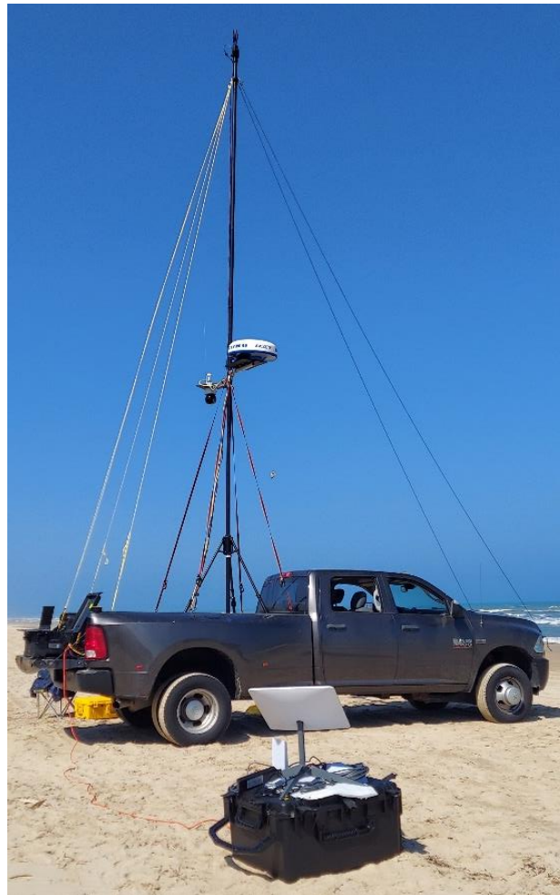
Figure 1. Starlink in the Foreground for a RDC MDA Test Event in Boca Chica TX.

The purpose of this evaluation was to demonstrate the capabilities of the Starlink Maritime system on various Coast Guard assets performing multiple missions, and to determine the systems usefulness in the CG.