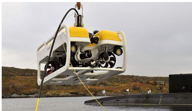
Figure 3. Marlin-350 UUV