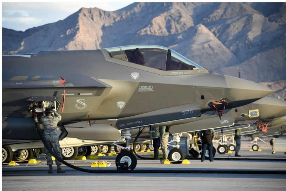
Figure 3: Refueling of an F-35A

GAO-20-234T