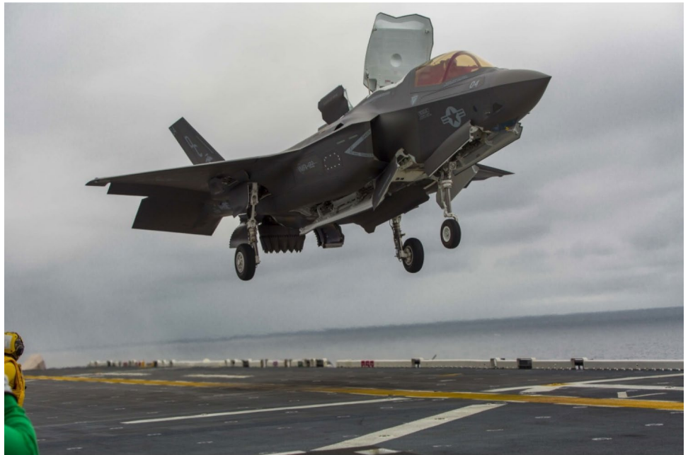
Figure 1: U.S. Marine Corps F-35B Conducting Training aboard the U.S.S. America

GAO-20-234T