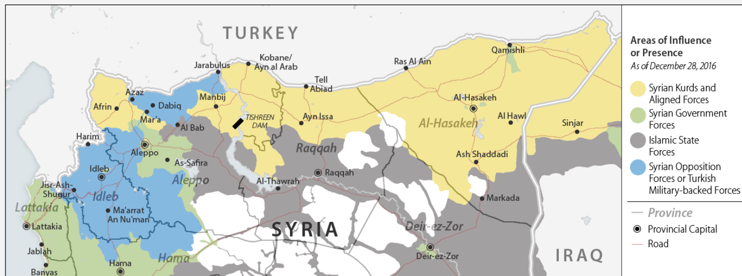
Figure 2. Syrian Kurds Countering the Islamic State: Map and Timeline

LATE 2013-EARLY 2014 As fighting between and among various Kurdish and Arab groups continues, the PYD/YPG establish a de facto ruling body for three northern Syrian cantons (Afrin, Kobane, Jazirah [the town of Qamishli and its surroundings]) with primacy over other Kurdish groups.