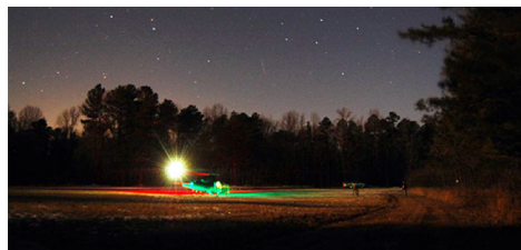
Figure 6: Examples of Bureau of Diplomatic Security Nighttime Training Exercises

DS and National Guard officials told us that Fort Pickett, which covers about 42,000 acres and is set in a rural area, can accommodate training at any hour, including exercises that involve noise from guns and explosives (see fig. 6). The Fort Pickett Base Commander told us that he did not have any concerns about DS's training activities. He stated that Fort Pickett has a good relationship with the surrounding counties and routinely has nighttime exercises with gunfire from tanks and small arms. For example, in the past year Fort Pickett has hosted 2 weeks of nighttime training that included artillery fire and helicopter takeoffs and landings. The Base Commander told us that DS's planned nighttime training will create less noise than current nighttime exercises. Furthermore, throughout the public comment period on the FASTC draft environmental impact statement, local residents did not express any concerns about potential nighttime exercises that DS might conduct at Fort Pickett.