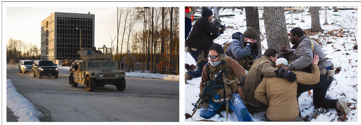
Figure 1: Examples of Bureau of Diplomatic Security Hard-Skills Training Exercises

Source: Department of State. | GAO-15-808R