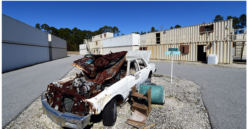
Figure 5: Federal Law Enforcement Training Centers Counter-Terror Operations Training Facility

GAO-15-808R