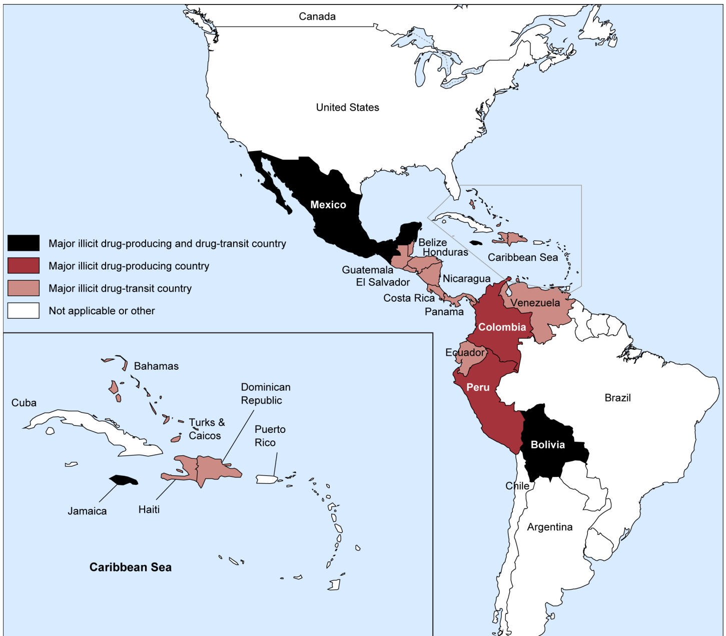
Figure 1: Map of Major Drug-Producing and Drug-Transit Countries in the Western Hemisphere

Source: Department of State's Bureau for International Narcotics and Law Enforcement Affairs, International Narcotics Control Strategy Report , Volume 1, Drug and Chemical Control, (March 2017). | GAO-18-10