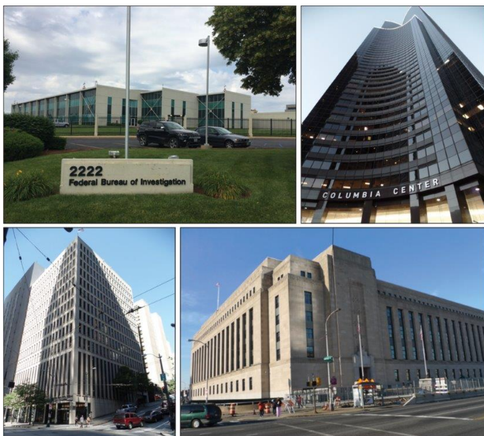
Figure 2: Foreign-Owned Buildings Containing High-Security Space Leased by the General Services Administration

Examples of high-security leased space are shown in figure 2.