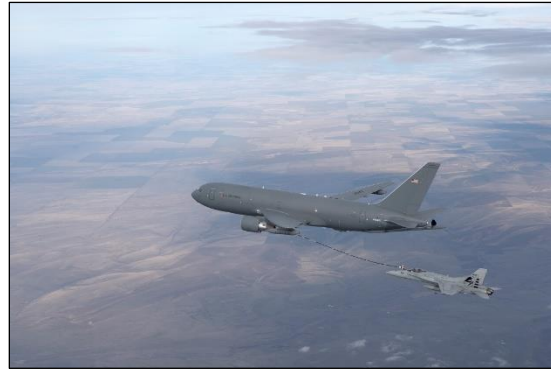
Figure 5. The KC46A Pegasus

In late 2021, Israel signed an LOA with the United States to purchase 12 Sikorsky “King Stallion” CH-53K Heavy Lift helicopters for $2 billion. The deal will enable Israel to replace its older model Sikorsky Yasur helicopters, which have been in use for nearly half a century. 99 Delivery is anticipated sometime between 2025 and 2026.