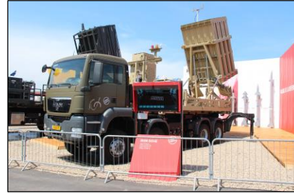
Figure 6. Iron Dome Launcher

To date, the United States has provided $1.7 billion to Israel for Iron Dome batteries, interceptors, co-production costs, and general maintenance (see Table 5). Because Iron Dome was developed by Israel alone, Israel initially retained proprietary technology rights to it. The United States and Israel have had a decades-long partnership in the development and co-production of other missile defense systems (such as the Arrow). As the United States began financially supporting Israel's development of Iron Dome in FY2011, U.S. interest in ultimately becoming a partner in its co-production grew. Congress then called for Iron Dome technology sharing and co-production with the United States. 110