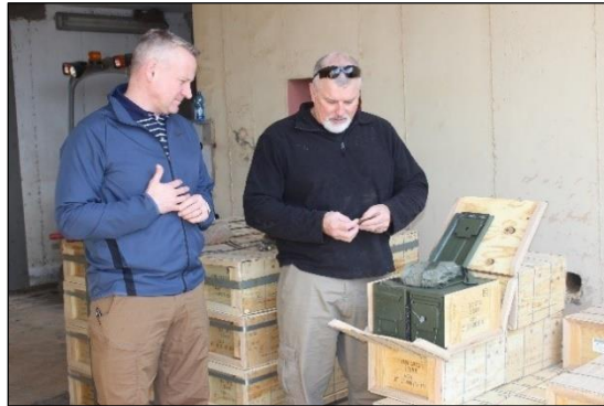
Figure 8. Army Officers Inspect WRSA-I