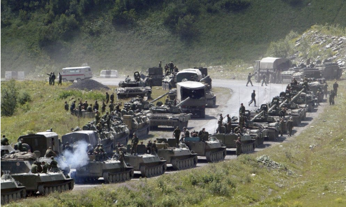
Figure 5. Russian Forces Marching on Tshkinvali, August 2008 180

combined with air interdiction by the Voyenno-vozdushnye Sily (Russian Air Force), inflicted heavy casualties on the Georgian army.