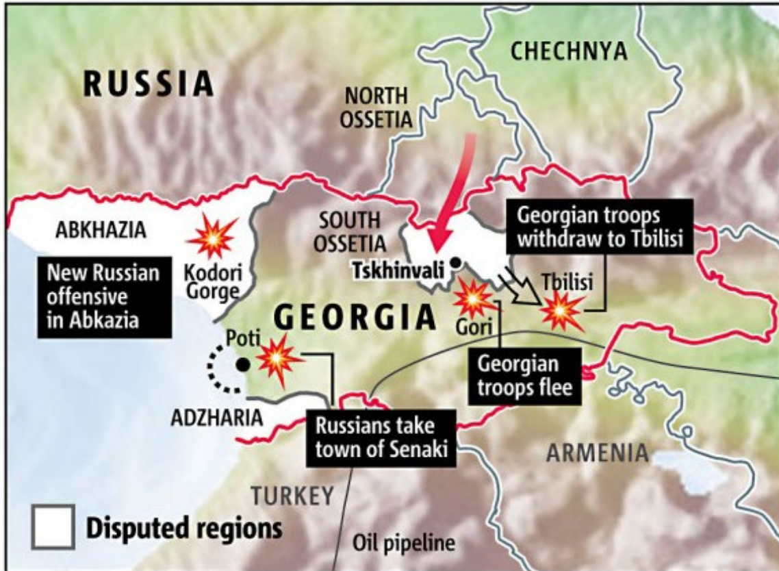
Figure 6. Map of Russian Advances Into Georgia, 12 August 2008 187