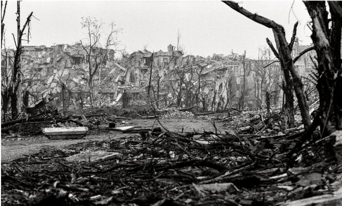
Figure 4. Grozny, January 1995 121