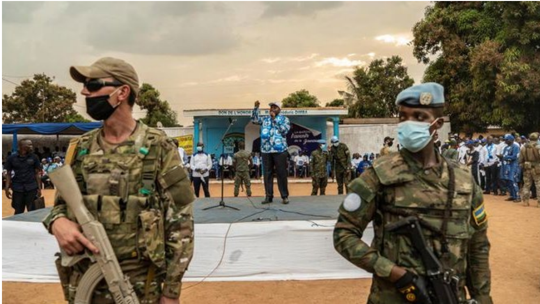
Figure 11. Russian PMCs Providing Presidential Security in CAR, 2021 264

professional CIW option to being referred to as “out of their depth.” 263 The case of Mozambique highlights these smaller PMC-centric approaches bring the advantages of lower risk and increased deniability but bring with them a greater chance of mission failure.