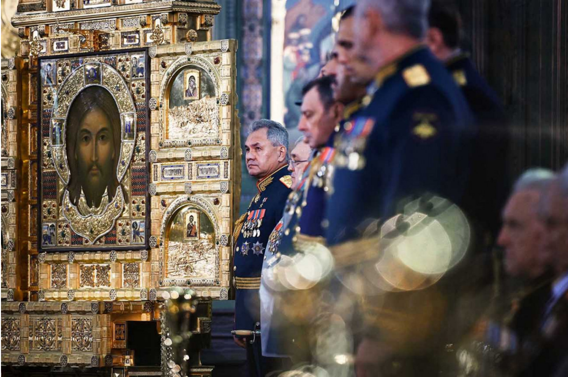
Figure 3. Minister of Defense Sergei Shoigu at the Consecration of the Armed Forces Cathedral, 2020 71

In addition to Messianism, reliance on military mass—dogpiling of forces to attrit the opponent as opposed to a Jominian style war-of-maneuver—has shaped the Russian approach to CIW. Throughout the Czarist period, the constant threat of state actors resulted in a large, conscripted Russian army—often committed to small wars. 72 As exemplified by the rapid mobilization of the Russian response to Napoleon, the Czarist approach relied on “an army based on universal service and a large trained reserve or militia.” 73 The myths of the October Revolution and subsequent Civil War did nothing to dissuade the forming Soviet military elite of the usefulness of large, massed formations. The Great