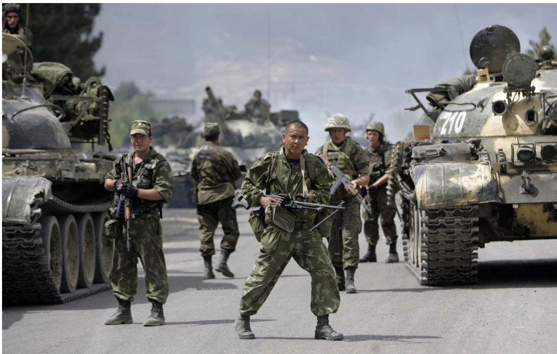
Figure 7. Russian Soldiers Manning Roadblocks Near Gori, August 2008 202

“Committee for Soldiers’ Mothers,” a non-governmental organization dedicated to eradicating dedovshina , also gained traction in the public eye. 198 The Russian MoD revamped marketing by investing in a series of high-quality recruitment videos with the slogan “ Sluzhba po kontraktu ,” service under contract. 199 An emphasis on deployability and readiness resulted in the conversion of Russia’s 203 divisions to 83 brigades, with the intent for each brigade to maintain “permanent readiness.” 200 This same momentum resulted in an increased focus on SOF—a noticeable trend in post-Georgian CIW operations. 201