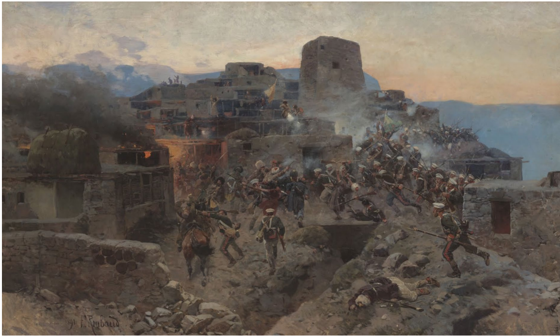
Figure 1. Painting of the Battle of Gimry, Dagestan, 1832 54

Terek defensive line in The Cossacks 51 and accounts of combat in Nabeg (The Raid) 52 provided a popular depiction of Tsarist CIW campaigns on a societal level, and the alien and brutal nature of Czarist CIW “seared themselves into the Russian imagination” 53 (see Figure 1).