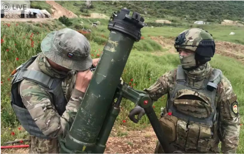
Figure 8. Russian Special Operations Supporting Syrian Arab Forces, May 2019. 230

Additionally, the Russian CIW force composition in Syria reflected lessons learned from their operations in the North Caucasus and Africa. Whereas the early days of the Second Chechen War exhibited the lack of population-centric focus of the First Chechen War, the Russian expeditionary force in Syria employed military police units composed of deliberately-recruited Muslim servicemen to secure humanitarian convoys, escort journalists onto the battlefield, and prevent sectarian violence by patrolling recently pacified regions in the country (see Figure 9). 231 The Russian military police concept was theoretically an adoption of American equivalents during the mid-2000s,