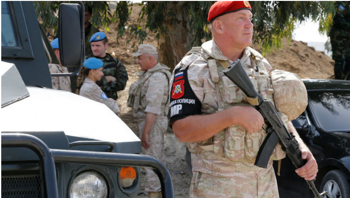
Figure 9. Russian Military Police Patrolling Manbij, January 2019. 234

Russian forces also shifted their force structure to emulate the Western concept of population-centric COIN. As early as the siege of Aleppo, Russian Reconciliation Centers were involved in implementing an overtly conciliatory approach to separatist Syrian forces. Units from the Russian expeditionary forces executed what Western practitioners would identify as Civil Affairs operations. Delivering humanitarian aid, establishing field hospitals for wounded civilians, and negotiating neighborhood-level ceasefires were an important part of the Russian CIW strategy in Syria. 233