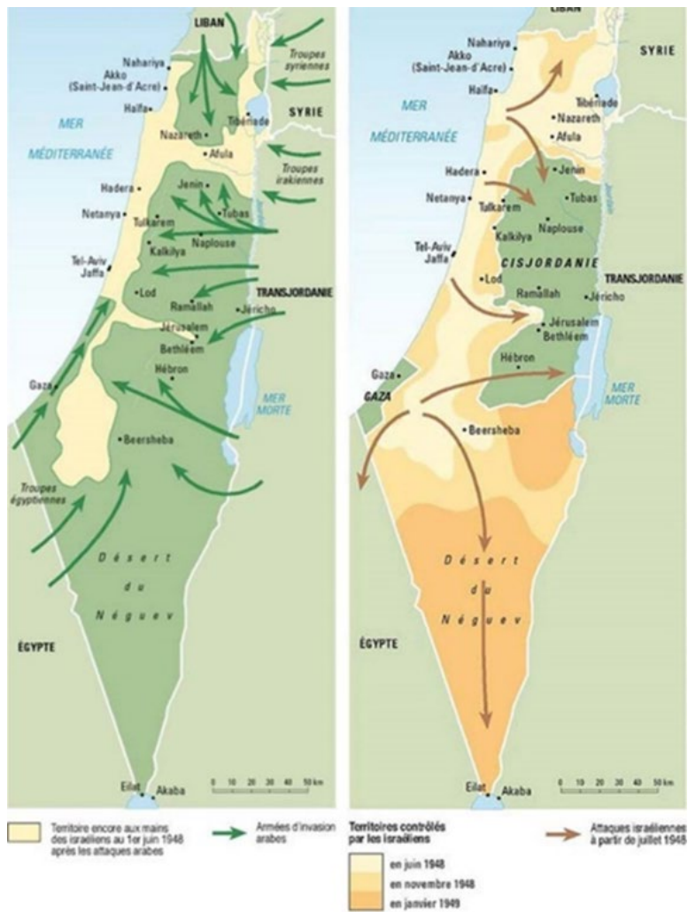
Figure 2. Arab League attack/IDF counterattack May 15 - July 9, 1948. Philippe Rekacewicz, "The first Arab-Israeli war (1948-49)," Le Monde Diplomatique , April 1998, accessed February 7, 2020, https://mondediplo.com/maps/middleeast1948 .

Notwithstanding the herculean effort by the JA to procure weapons abroad, the embargo caused unforeseen difficulties. The Haganah General Staff (HGS) had postponed massive arms deliveries until after the end of the British Mandate on May 15. The delay meant not only that the weapons were not readily available at the onset of the war, but the bulk of the heavy weapons imports arrived at Israel during the truce. Fortunately for the Israelis, the lack of an attempt from the Arabs to conduct a sea blockade and the dismal UN observatory capabilities worked in favor of the Haganah, and they proceeded to outmatch and outpace the regeneration of combat power