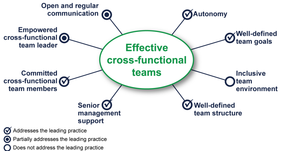
Figure 2: GAO Assessment of the Extent to Which DOD’s Draft Guidance Incorporates Leading Practices for Effective Cross-Functional Teams

Source: GAO analysis of Department of Defense (DOD) information and articles, case studies, subject-matter expert interviews, and congressional testimonies on cross-functional teams. | GAO-18-194