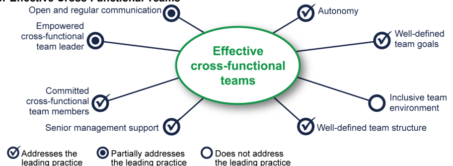
GAO Assessment of the Extent to Which DOD's Draft Guidance Addresses Leading Practices for Effective Cross-Functional Teams