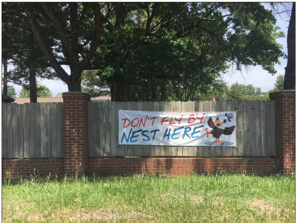
Figure 2: Advertisement Seeking Tenants for Privatized Housing

or offering rent concessions. While these actions can increase occupancy, advertising adds costs to project operations, and rent concessions lower the per-unit revenue earned for the project. Figure 2 shows an advertisement by a privatized housing project seeking tenants outside of Naval Station Norfolk in Virginia.