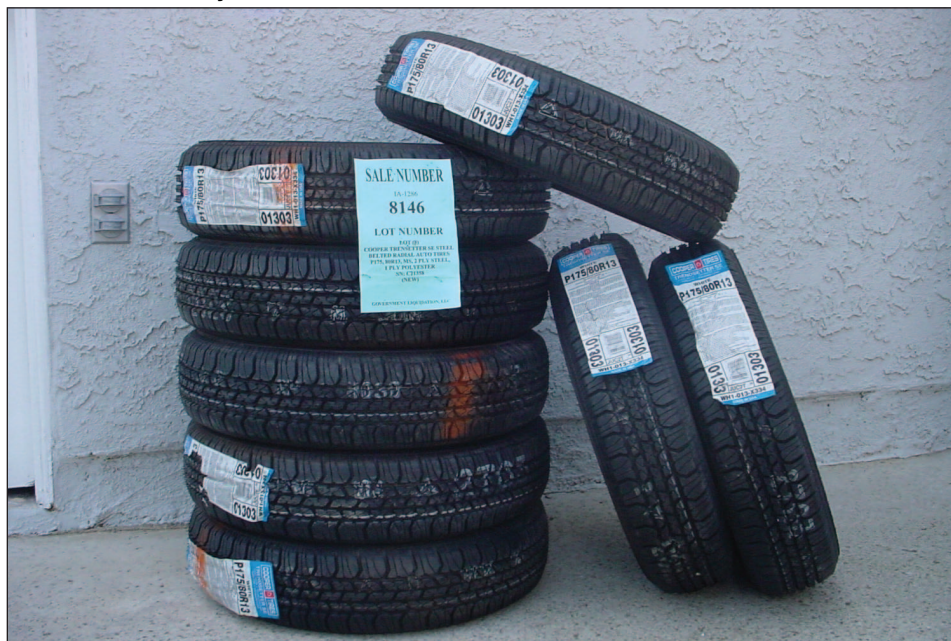
Figure 3: New, Unused Excess Cooper Trendsetter SE Tires Purchased over the Internet in February 2005

forklift. DOD units are continuing to purchase and use these same tires. The most recent purchase of 50 of these tires was made in April 2005. The eight tires had a total reported acquisition value of $404. We paid $113 for the tires, including buyer's premium and tax, and an additional $154 shipping cost. The tires were listed in A4 condition (usable, with some wear). However, we found that the tires still had manufacturer labels on the tread and blue paint over the whitewalls, indicating that they were new and unused. The tires were turned in as excess by the North Island Naval Air Station's Aircraft Intermediate Maintenance Detachment. According to the Army Tank Automotive and Armaments Command Project Officer, 13 the NSN listed on the turn-in document was incorrect. We found that inaccurate item descriptions, including NSNs, prevent items from being selected for reutilization. Figure 3 is a photograph of the excess DOD tires that we purchased over the Internet in February 2005.