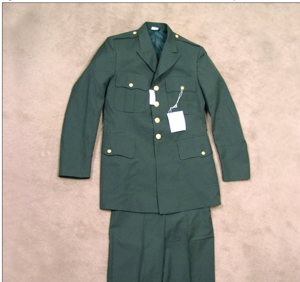
Figure 4: New, Unused Excess Class A Uniforms Purchased in April 2005