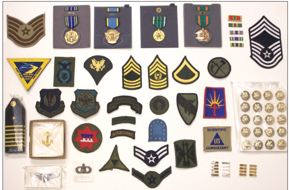
Figure 2: Examples of Excess DOD Badges, Medals, and Insignias Purchased over the Internet in December 2004

Army Rangers, Mountain, and Airborne; Air Force Air Traffic Controller; and DOD Scientific Consultant. Rank insignias include Air Force Chief Master Sergeant and Air Force Technical Sergeant; Navy Captain, Midshipman Lieutenant, and Midshipman Lieutenant Commander; and Army Command Sergeant Major and Master Sergeant. The listed condition code of these items ranged from A4 (serviceable, usable condition) to H7 (unserviceable, condemned condition). However, our inspection of the badges and insignias that we purchased showed that none of them had been used, and many of them were in original manufacturer packages. Further, DOD is continuing to purchase and use most of these items. The photograph in figure 2 shows examples of some of the badges, medals, and insignias that we purchased.