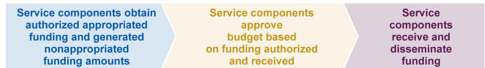
Figure 3: Overview of the Services' Funding Process for the Department of Defense's Morale, Welfare, and Recreation Programs

Source: GAO analysis of service documents and information. | GAO-18-424