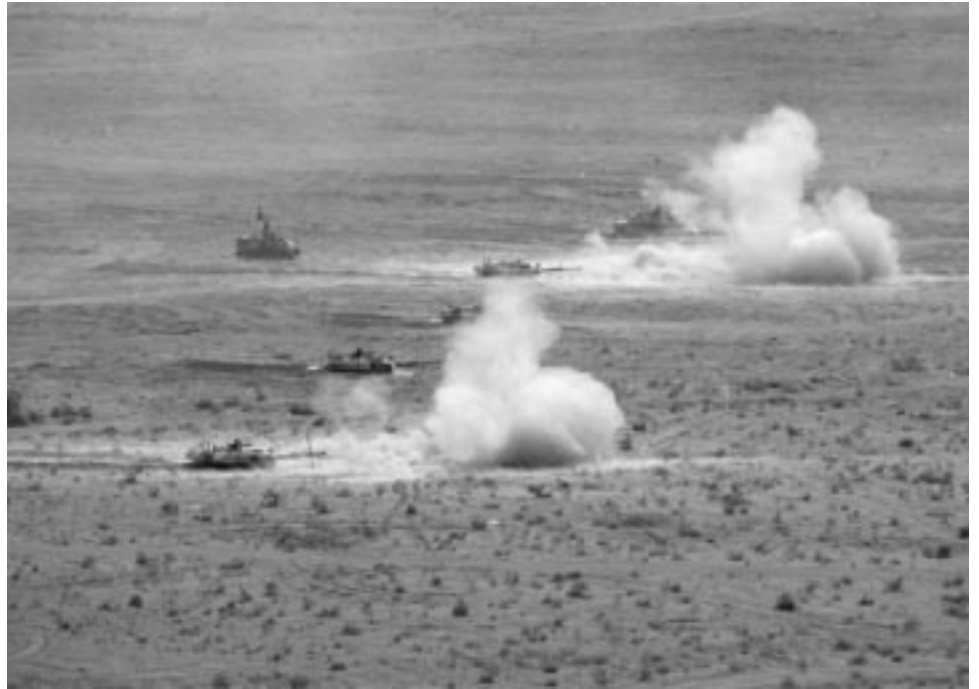
Figure 1: Desert Environment at the National Training Center

The Combat Maneuver Training Center is the only training area available to Army forces in Europe for the conduct of battalion-level exercises. According to center officials, geographical limitations of the center's rolling wooded terrain do not allow brigades to train at doctrinal distances, and two battalions can only train simultaneously with some acknowledged doctrinal degradation. (See fig. 2.)