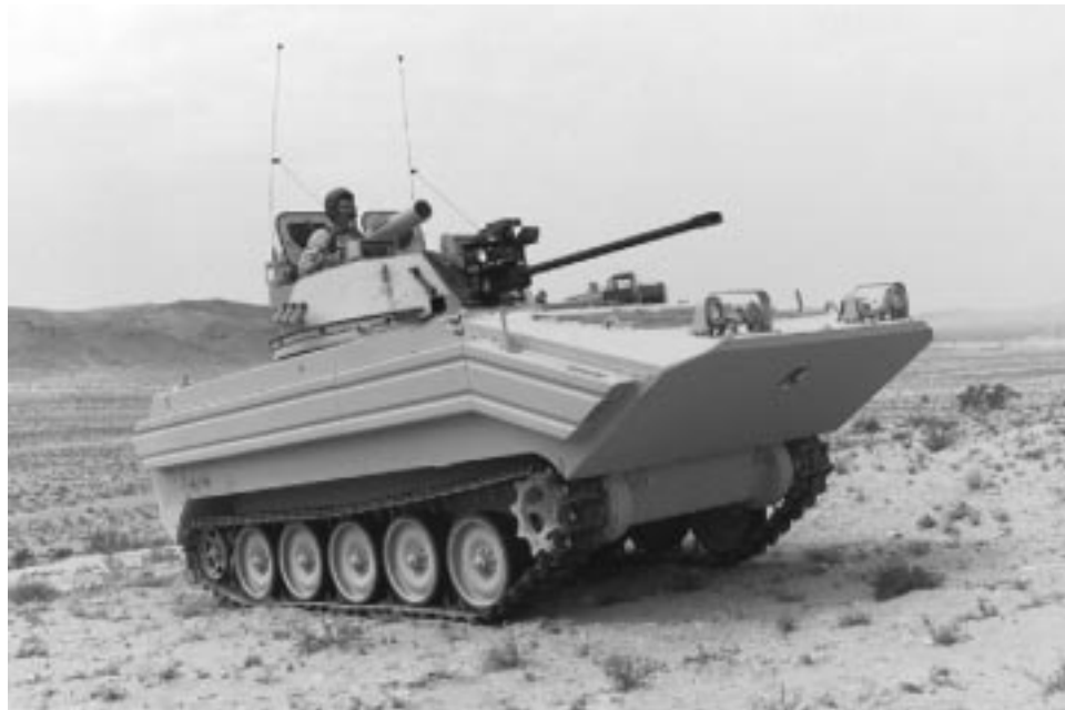
Figure 4: Opposing Force Vehicle and Soldier at the National Training Center

At the NTC and the JRTC, the Army has established pre-positioned stocks of equipment that units draw and use during the exercises. The NTC equipment consists of about 3,800 major pieces of equipment, including tanks, fighting vehicles, artillery pieces, personnel carriers, recovery vehicles, and various types of wheeled vehicles. Generally, units training at the NTC ship their wheeled vehicles and unique equipment items to the center, and they draw their tracked vehicles from the pre-positioned stocks. The pre-positioned equipment at the JRTC consists of about 1,100 major pieces of equipment, mainly wheeled vehicles. Units ship their tracked vehicles to this center for training. The CMTC does not have a pre-positioned stock of equipment.