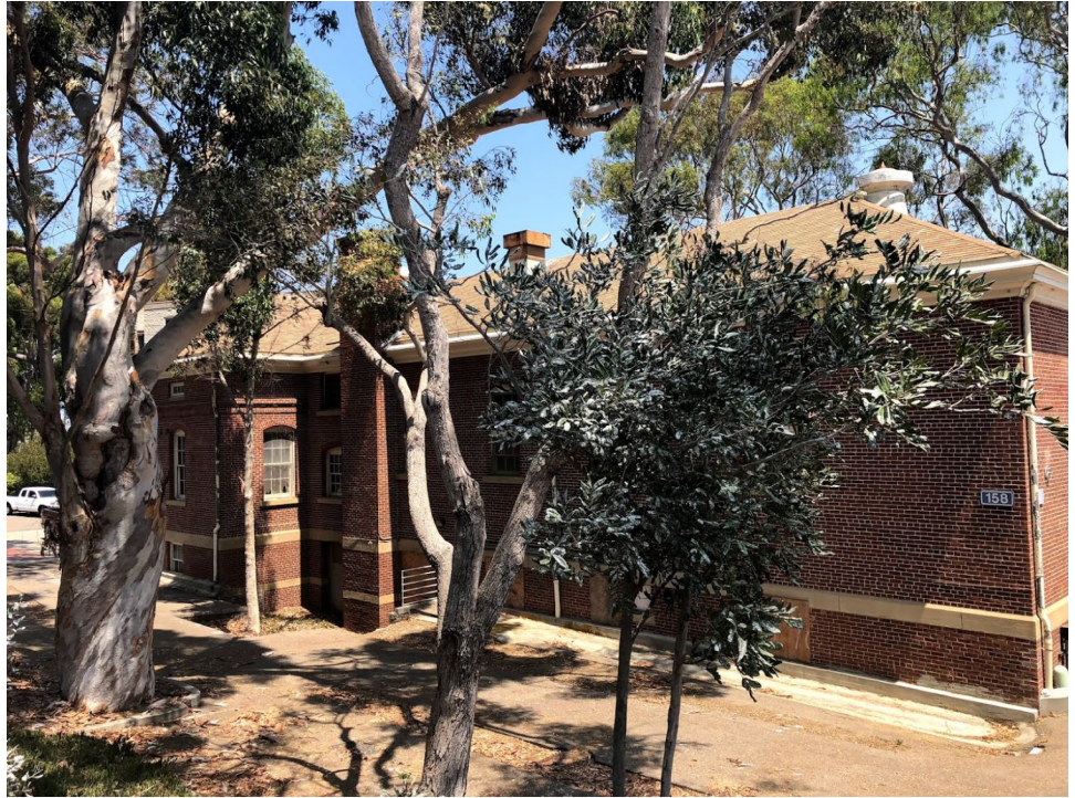
Figure 1: Historic Property Planned for Use as the Headquarters of an Installation's Security Division

Installation officials said this historic property has remained empty for about 10 years.