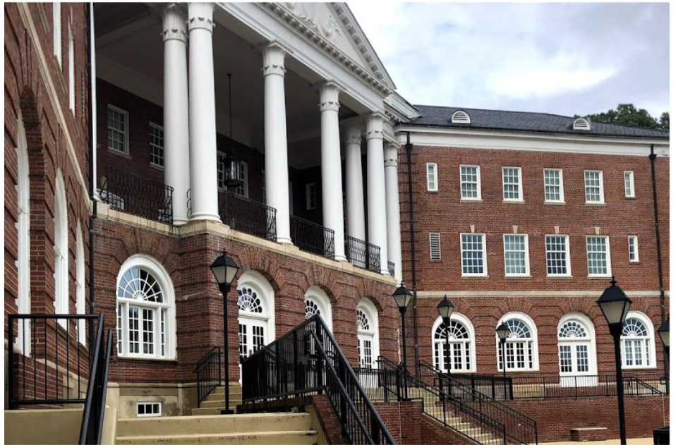
Figure 3: Example of Historic Property After Renovations with Modern Materials, as of September 2018

According to installation officials, renovations to this historic property's windows were completed using modern materials such as vinyl, which were less costly than the period-accurate wood.