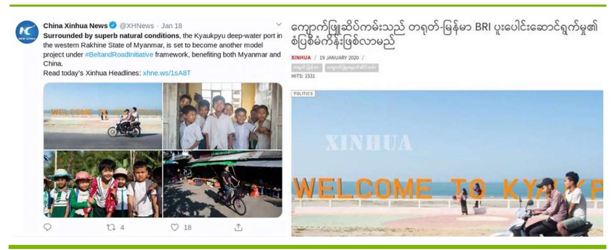
Figure 2. Xinhua English and Burmese reporting on Kyaukphyu port project's benefits to local citizens in Myanmar

Source: China Xinhua News, "#BeltandRoadInitiative," Twitter Jan. 18, 2020, accessed Jan. 2020, https://twitter.com/search?q=%40XHNews%20surrounded%20by%20superb%20natural%20conditions&src=ty ped_query. "Kyaukphyu Port Will be a Model Project of Sino-Myanmar BRI Cooperation," (ကျောက်ဖြူဆိပ်ကမ်းသည် တရုတ်-မြန်မာ BRI ပူးပေါင်းဆောင်ရွက်မှု၏ စံပြစီမံကိန်းဖြစ်လာမည်), Xinhua Myanmar , Jan. 19, 2020, accessed Jul. 30, 2020, https://xinhuamyanmar.com/sino-myanmar/politics/26026-bri.