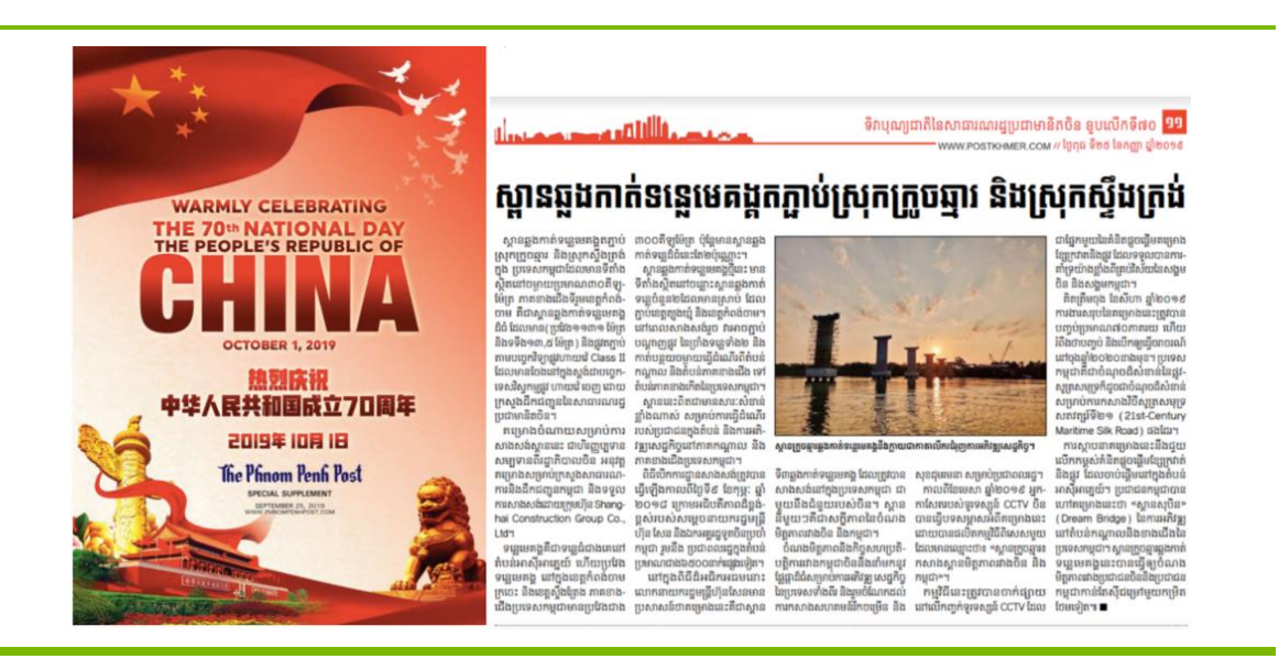
Figure 1. "Special Supplement" in the Phnom Penh Post, with articles promoting BRI projects