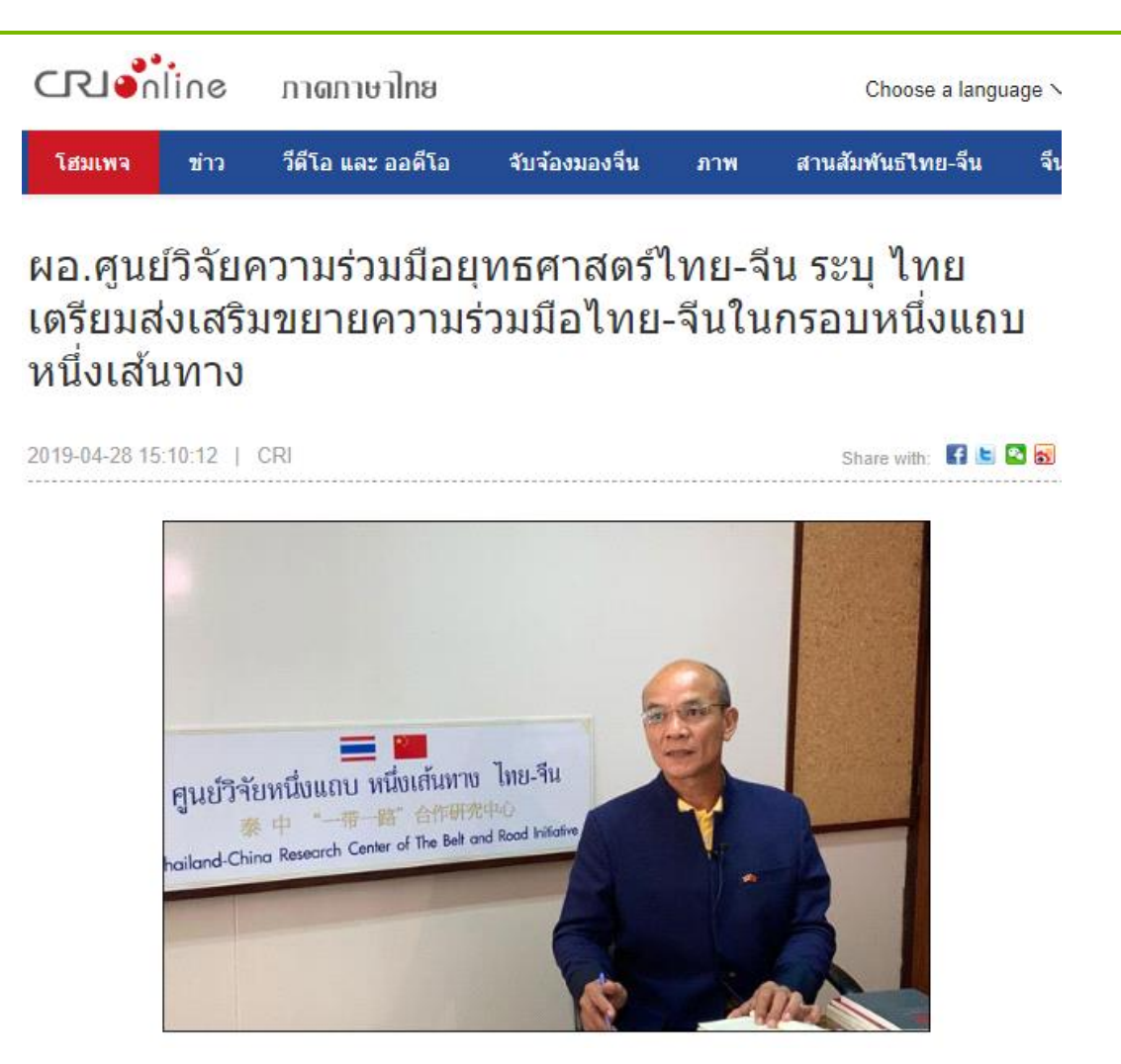
Figure 3. CRI Thai reporting using local voices to bolster BRI cooperation

Source: "The Director of the Thai-Chinese Strategic Cooperation Research Center Stated that Thailand is Preparing to Promote Thai-Chinese Cooperation in the Framework of 'One Belt One Road'," ผอ.ศูนย์วิจัยความร่วมมือยุทธศาสตร์ไทย-จีน ระบุ ไทยเตรียมส่งเสริมขยายความร่วมมือไทย-จีนในกรอบหนึ่งแถบหนึ่งเส้นทาง, CRI Thailand, Apr. 28, 2019, accessed Mar. 11, 2020, <u>http://thai.cri.cn/20190428/e90079ae-991f-57c3-a6e7-2795d8d5d27a.html</u>.