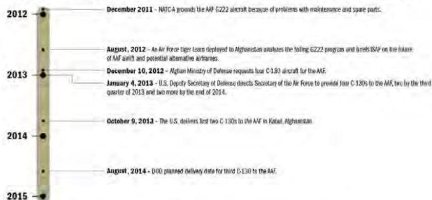
Figure 1 - Timeline of Significant Events in the Selection and Delivery of C-130s for the AAF