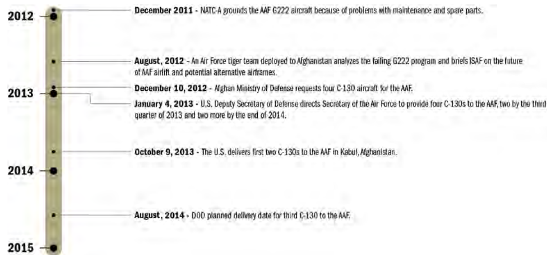
Figure 1 - Timeline of Significant Events in the Selection and Delivery of C-130s for the AAF