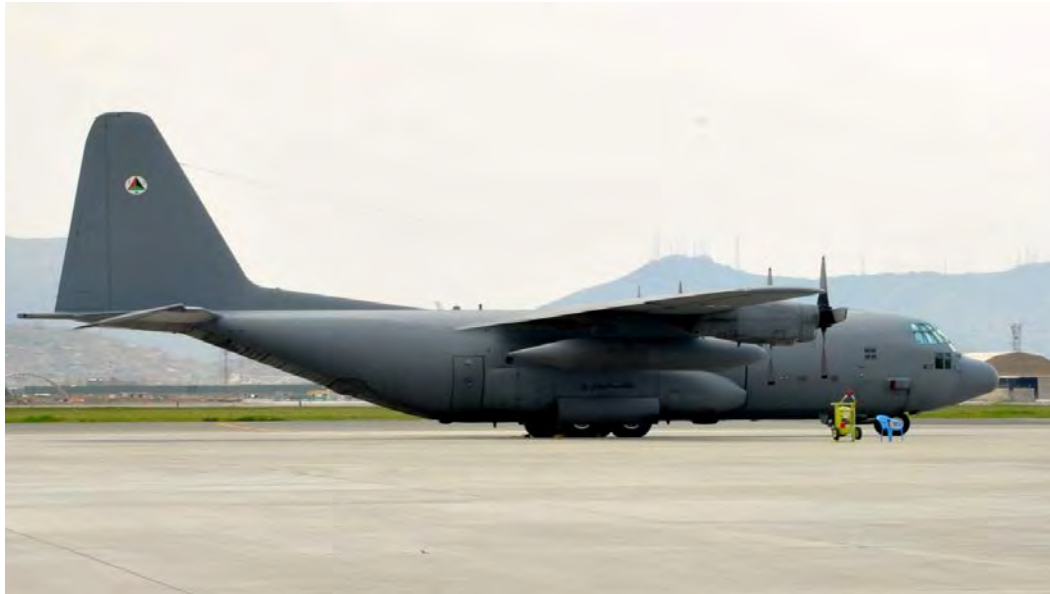
Photo 1 - AAF C-130 on the Flightline at the Kabul Air Wing—Kabul International Airport