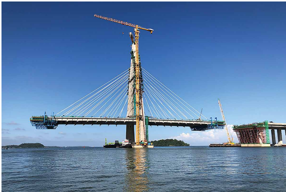
Part of China’s Belt and Road Initiative, the partially completed bridge at the Kota Batu end of the Temburong Bridge construction project in Brunei.

economic means; 12 hence, economic power is seen as a means of generating greater political influence among the countries Beijing seeks to win over into its camp. The goal of economic initiatives (like the BRI) is linked to how Chinese leaders seek to present and project Beijing’s worldview to others and to ultimately achieve China’s foreign policy and domestic goals. This “selling” of Beijing’s worldview is also closely linked to how Chinese soft power is being conceptualized and operationalized. While western iterations of soft power tend to emphasize the non-coercive aspect of soft power, and thus the stress on culture and values as instruments of soft power, 13 such a distinction as to whether economics ought to be seen as “hard” or “soft power” is less clear cut in China. According to one study, Chinese discourse concerning soft power is frequently expressed within its domestic context and towards