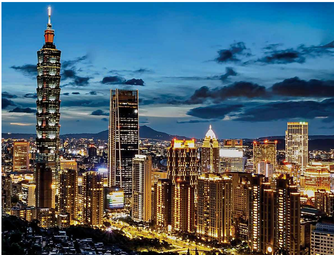
Taipei skyline view in 2020. The global pandemic is likely to harden Beijing's positions on matters of party legitimacy and national sovereignty, such as over Taiwan.

faced by many western countries (in particular the United States) during the ongoing pandemic, the possibility of shifting postures towards China in a post-pandemic world (when that happens) cannot be ruled out. As such, one might argue that the Chinese government might adjust its policies—so long as they do not impinge on its domestic control—in response to how other countries react.