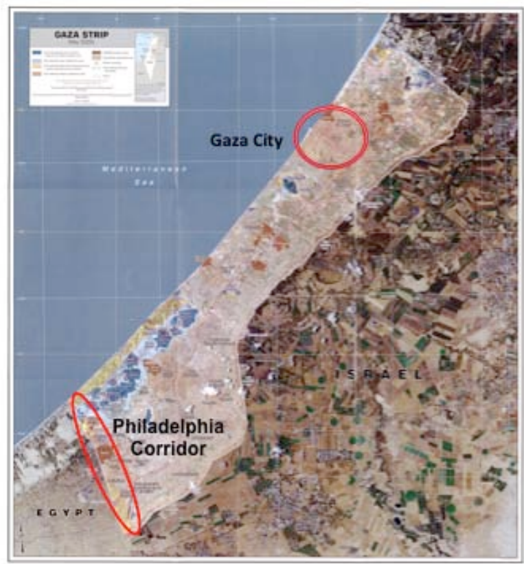
Figure 2.3 Gaza City and the Philadelphia Corridor 113

"Divisive" might be the single word best describing the implications of the Palestinian issue. It cuts rifts between Palestinians themselves. It segments Israel. It factionalizes the Arab and the larger Muslim world, both intra- and internationally. Egypt, for example, rejected Hamas demands to open the Rafi crossing between the Sinai and Gaza