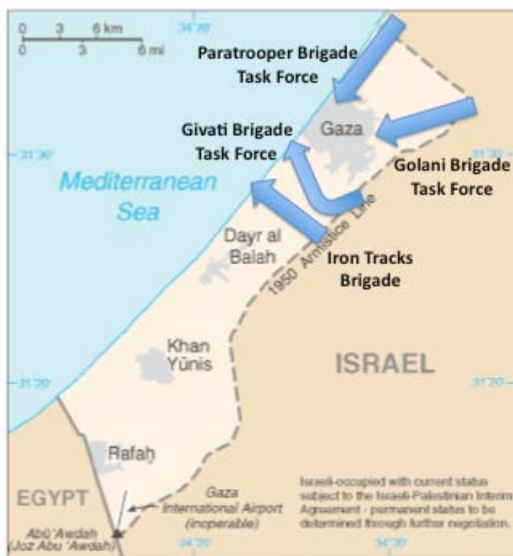
Figure 2.2 Primary IDF Ground Force Attacks into Gaza 104

paths through built-up areas after imagery from UAVs helped commanders select the most promising routes of advance. The army favored night operations, knowing that Qassam Brigade and other forces that might be supporting Hamas were deficient in both night-vision systems and the training needed to effectively operate under conditions of limited visibility. Combined arms tactics sought to maneuver the enemy out of position or employ firepower to eliminate threats in-place with minimal danger to IDF personnel. 105 Infantry led the way in urban areas, calling tanks, armored bulldozers, or