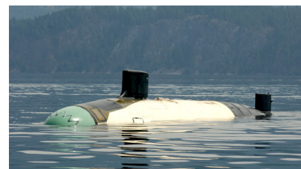
An aerial view of ARD Bayview (top). The Submarine Dolly Varden on the surface at Lake Pend Oreille (bottom).