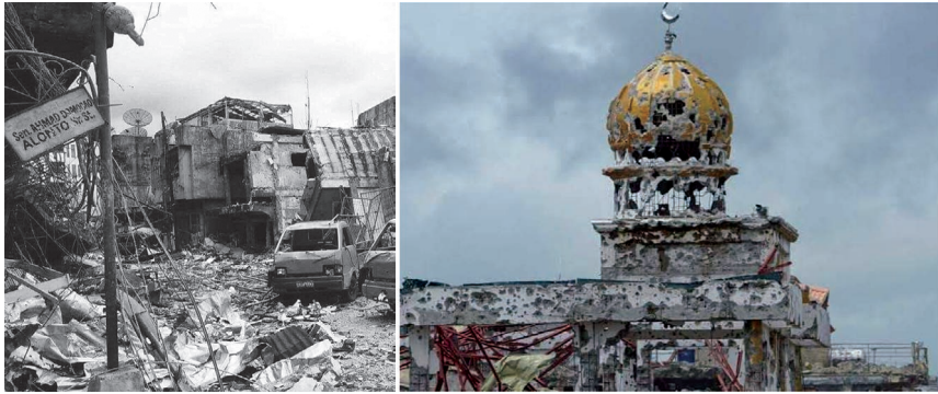
Figure 1.3 Marawi After the 2017 Conflict