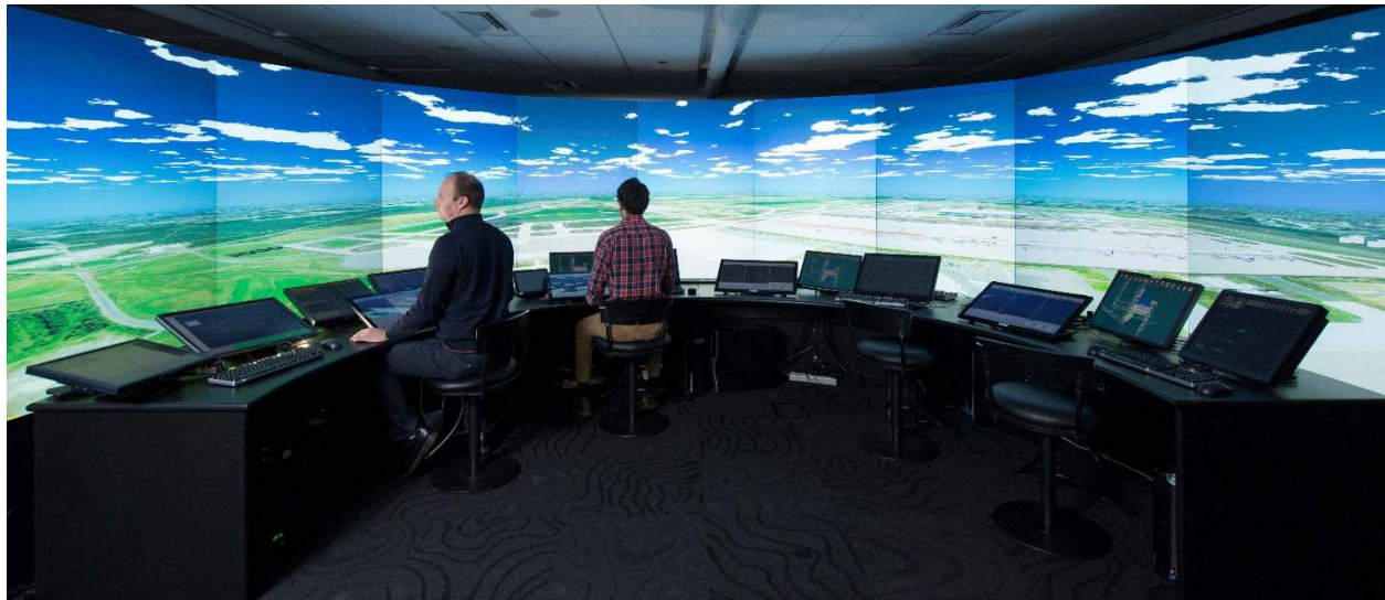
Figure 2: Picture of the Tower environment in the IDEA Lab.

Working in the IDEA Lab together with the Federal Aviation Administration, National Air Traffic Controllers Association, Air Line Pilots Association, civil aviation authorities of various countries, and other organizations, MITRE has helped improve aerospace systems in a number of key areas, such as airspace redesign, controller training prototypes, airport/runway siting, and incorporating UAS into the NAS.