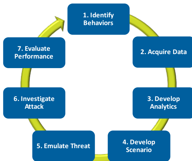
Figure 4. ATT&CK-Based Analytics Development Method

It is important to note that the Blue and Red Teams of the cyber game exercises were held asynchronously from each other for the duration of MITRE’s research. This typically meant performing Blue Team evaluations several weeks after Red Team events. There were several reasons for taking this approach over the more traditional synchronous method. The first was that the research was focused on detecting the adversary, not remediating or attempting to hinder it. In fact, detecting Red Team activity and stopping their behavior in real time would have prevented using the engagement to ascertain multiple ways of detecting the emulated threat. Secondly, asynchronous exercises more accurately emulate the all-too-common real-world situation of defenders not being notified of adversary activity until after the fact. This is often the more challenging case, as defenders usually have little indication of the time ranges on which to focus their search.