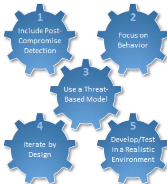
Figure 1. Five Principles of Threat-Based Security

Principle 5: Develop and Test in a Realistic Environment – Analytic development and refinement should be performed in a production network environment, or one that matches realistic network conditions as closely as possible. Behavior generated by real network users should be present to account for the expected level of sensor noise generated by standard network use. Whenever possible, detection capabilities should be tested by emulation of adversary behavior within that environment.