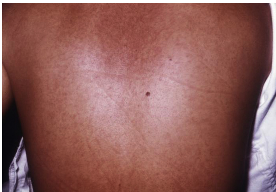
Fig. 1. Maculopapular rash.

Urticaria presents with acute, swollen, red wheals or plaques, typically associated with pruritis (Fig. 2). They occur due to a variety of causes and have been documented to occur with COVID-19. One study by Recalcati found urticaria in 3 of 88 COVID-19 patients [11]. There have been other reports of urticaria affecting various regions of the