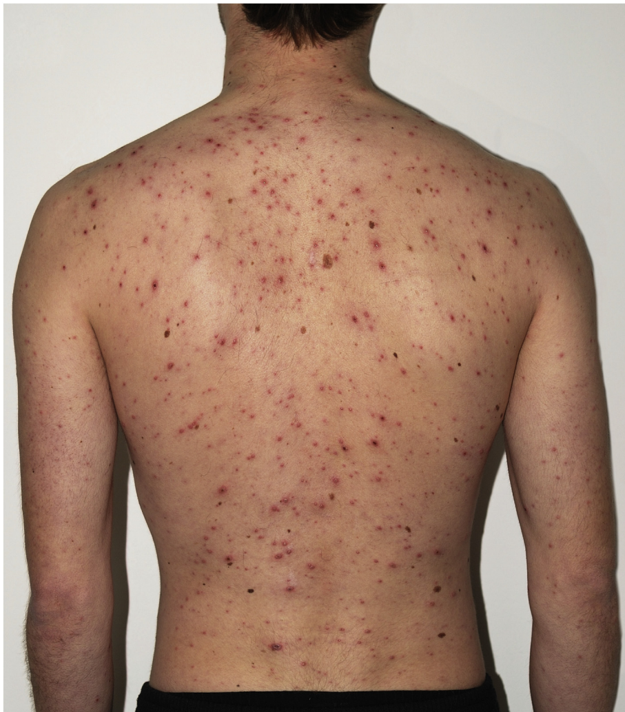
Fig. 3. Vesicular rash.