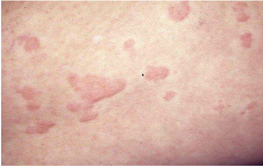
Fig. 2. Urticaria.