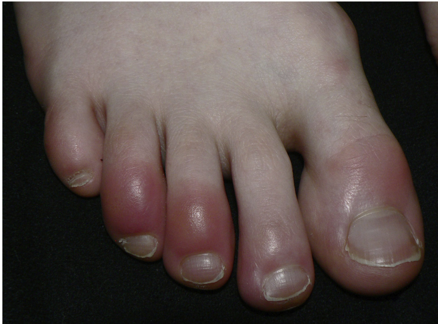
Fig. 5. Chilblains of the foot.

Petechiae are small, subdermal hemorrhages, while purpura are larger variants of this (Fig. 4). This rash is less commonly described than some of the other rashes, though there are a few case reports describing this in the literature. One case report described a patient with petechiae who was initially misdiagnosed as dengue fever (in an endemic area), but later discovered to have COVID-19 [35]. In this case, the patient was also noted to be significantly thrombocytopenic [35].