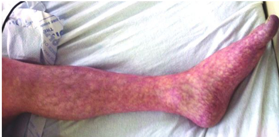
Fig. 6. Livedo reticularis of the lower extremity.