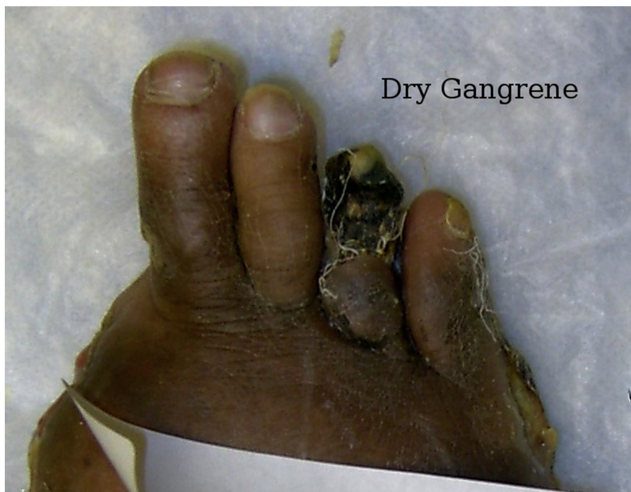
Fig. 7. Necrotic toe.

Livedo racemosa (LR) is a violaceous web or net-like patterning of the skin similar to livedo reticularis; however, this is found diffusely, compared to livedo reticularis that is found in gravity-dependent areas (Fig. 6) [39]. Reports have described LR or retiform purpura (branching grouping of purpura) in 3 patients in one series [15], as well as several other case reports [19,40]. One series of 21 cases found