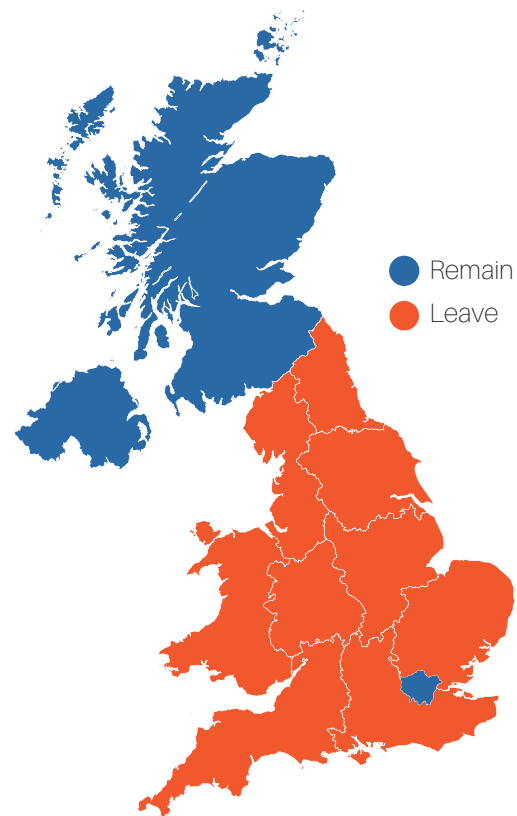
Figure 1.2. Regional results of UK referendum on membership of the EU

fears that Britain's example could inspire other Eurosceptic movements in France, Germany, the Netherlands, Sweden and elsewhere. 13