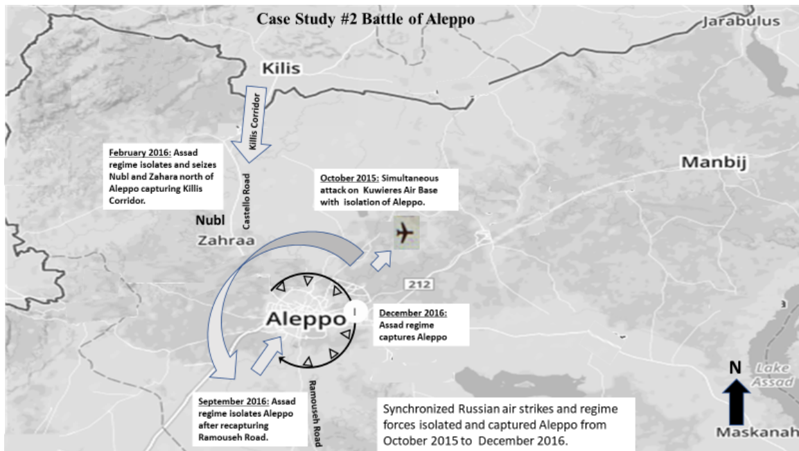
Figure 5. Battle of Aleppo Map

advances just 5 percent of East Aleppo was still in opposition hands. 268 The rapid advance by the Assad regime through Aleppo was helped with UAV imagery giving the Assad regime confidence to advance boldly on the poorly coordinated FSA. 269 On December 22, the Syrian government declared all of Aleppo was back under its control (reference figure 5). 270 In 2016, a breakdown of announced Assad regime fighters killed in Syria identified 1,100 Lebanese, 650 Afghans, 488 Iranians, 144 Pakistanis, and 94 Iraqis. 271