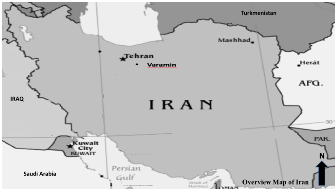
Figure 2. Overview Map of Iran

his newly formed revolutionary council preparing the way for an overthrow of the Shah's government. 6 Ayatollah Khomeini showed strategic patience subverting the Shah's government by setting conditions through a network of clerics and system of messaging for over fifteen years. 7 On February 1, 1979, a popular movement catalyzed when the people emerged in angry protest until the Shah was removed from power crystallizing the Islamic Revolution. In the vacuum created by the Shah's removal, Ayatollah Khomeini returned from exile and seized power as the new Supreme Leader of Iran (reference figure 2). Ayatollah Khomeini proactively suppressed future threats by quickly bringing pro-western leaders to summary trials and executions to secure power. 8