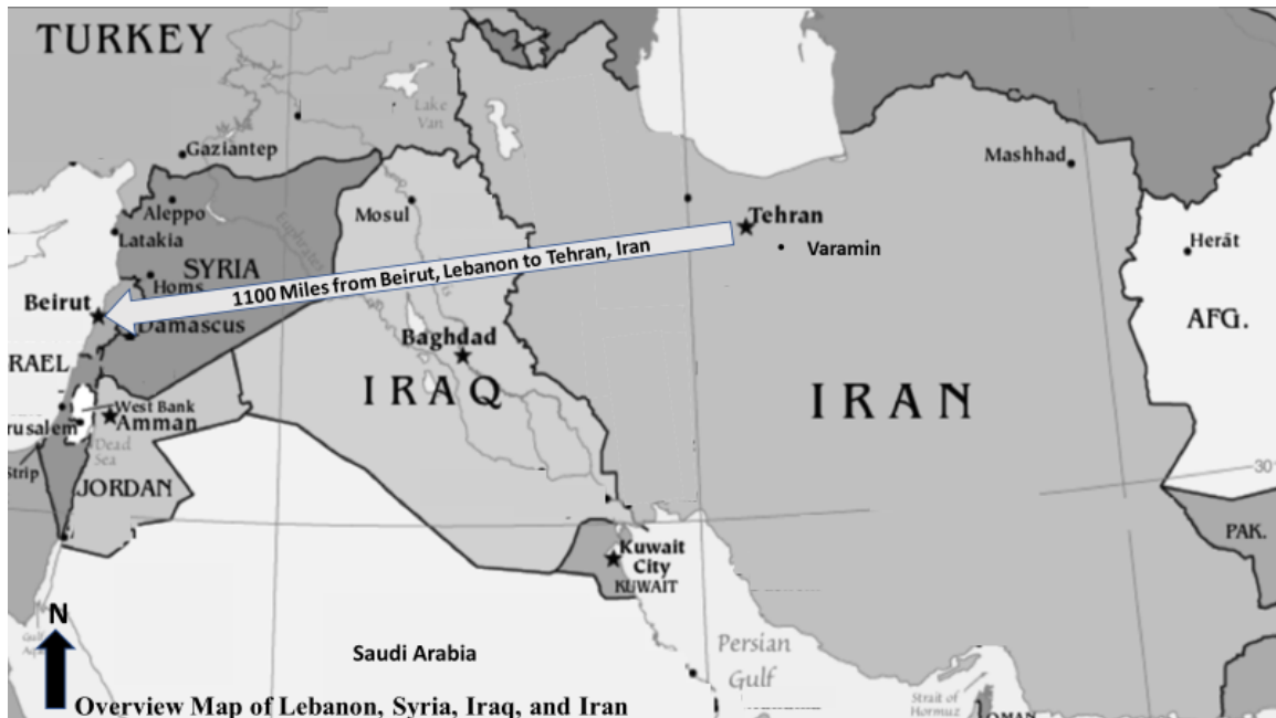
Figure 3. Overview Map of Lebanon, Syria, Iraq, and Iran