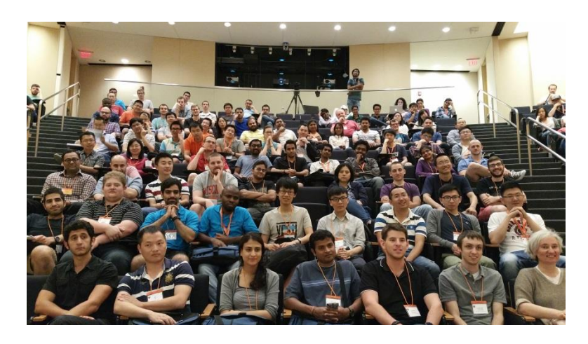
A Lecture Session