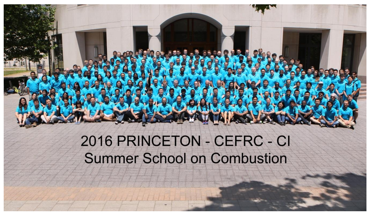
Group Portrait: A Magnificent Sea of Blue!