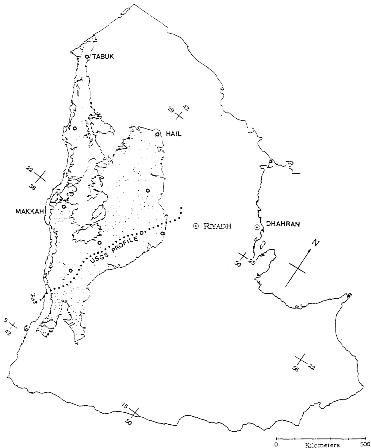
Figure 3. Planned broadband station deployment (small circles). Lightly stippled area is Arabian Shield; Quaternary lava cover within the shield is not stippled. In the first phase of our deployment, the four stations along the USGS profile and at Hail and Makkah would be operated. In the second phase, the four stations along the Red Sea coast and the 4 running along the northeast edge of the shield would be occupied. 6-component stations exist at Riyadh.