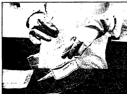
Figure 2. Swipe sampling kit

If the BioHAZ Kit tests indicate that no biological materials are present, the Incident Commander can scale back the response efforts toward termination of the incident. This is the case with the responses to hoaxes, such as the ubiquitous anthrax scare letters.