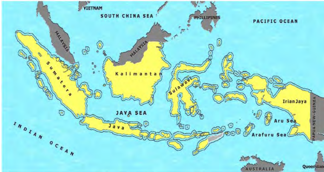
Figure 1. Illustrative Map of Indonesia Territorial Based on the TZMKO 1939. 39

miles, but also stated that all the waters surrounding the Indonesian archipelago were integral parts of Indonesian territory. 38