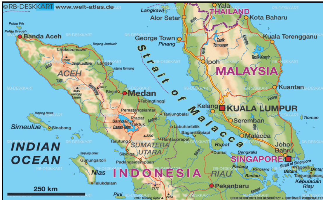
Figure 4. The Malacca Straits (The Strait of Malacca and the Strait of Singapore). 90