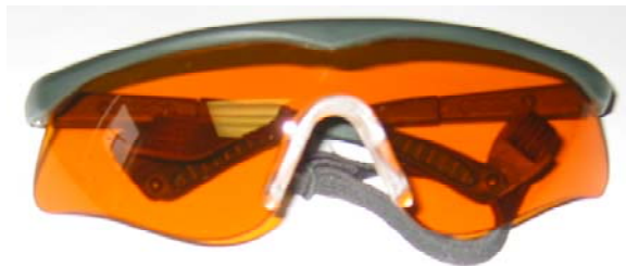
Figure 3: Orange Lens