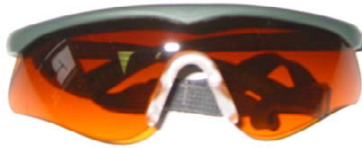
Figure 4: Gradient Orange Lens