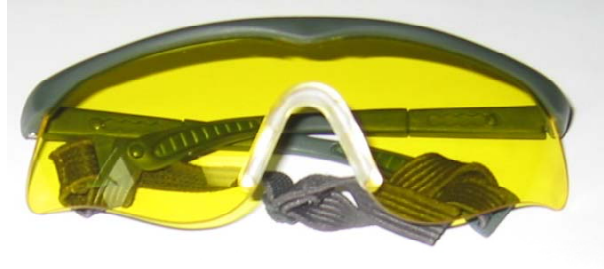
Figure 1: Yellow Lens