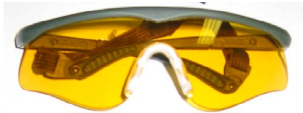
Figure 2: Amber Lens