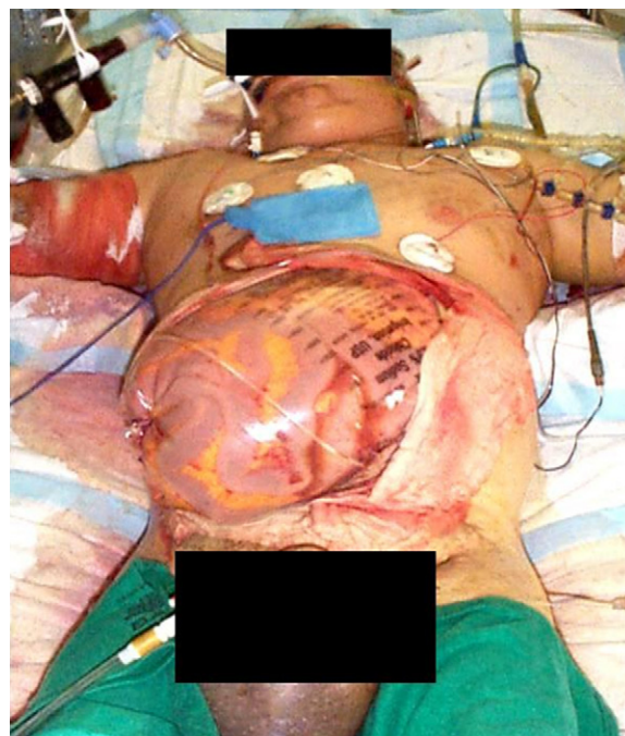
Fig. 2 – Abdominal compartment syndrome in severe burns is associated with a 70–100% mortality rate.

The development of the Parkland formula in 1968, a crystalloid only formula by Baxter and Shires, stemmed from elucidation of important concepts in burn physiology from their studies