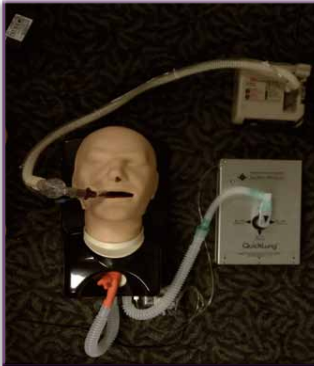
Figure 3 King LT ventilation