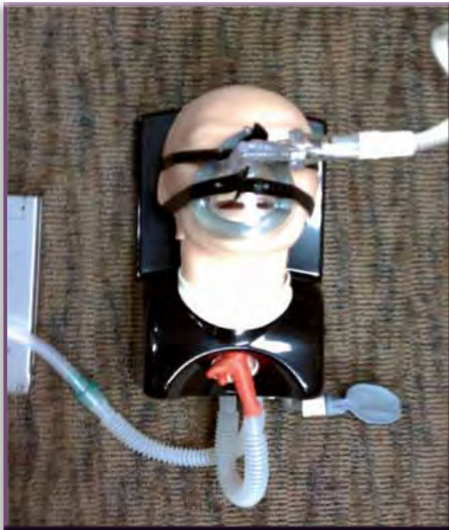
Figure 5 Mask with 4-tailed head strap Ventilation

physical appearance of an airway injury and other injuries associated with battlefield trauma. We used fixed compliance of 50ml/cmH 2 O and resistance 5cmH 2 O/L/s that represents a patient with mild to moderate respiratory impairment. There is currently no data regarding the respiratory status of wounded casualties or out of hospital patients at the point of injury. Other variables such as gastric pressure and its impact on the ventilation of casualties and the effect of non-invasive ventilation on air entering the esophagus may also be different in real scenarios.