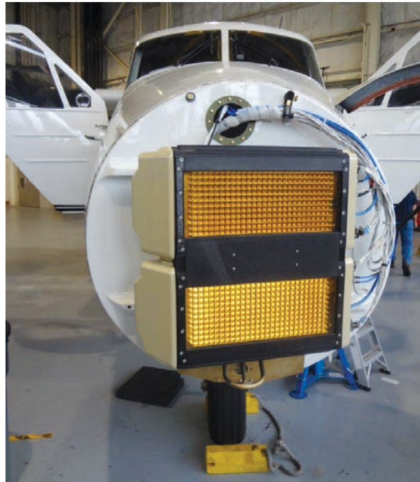
The Airborne Sense and Avoid Radar Panel is seen during installation on a Twin Otter aircraft.

The Airborne Sense and Avoid (ABSAA) Radar Panel, a highly capable phased array antenna developed by MIT Lincoln Laboratory, has the potential to