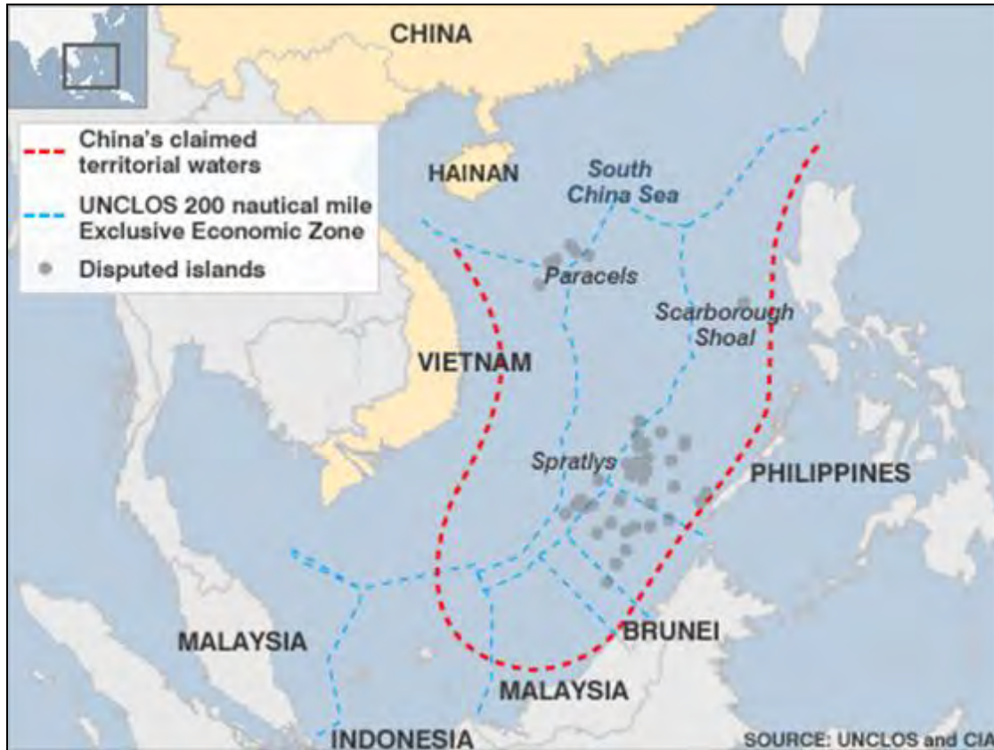
Figure 4. EEZs Overlapping Zone Enclosed by Map of Nine-Dash Line