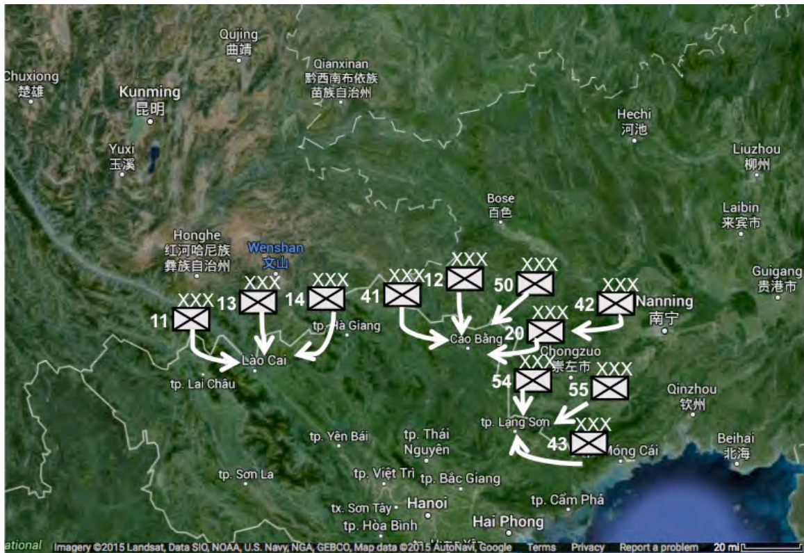
Figure 2. Map of Chinese Units at the Sino-Vietnamese Border, February 1979