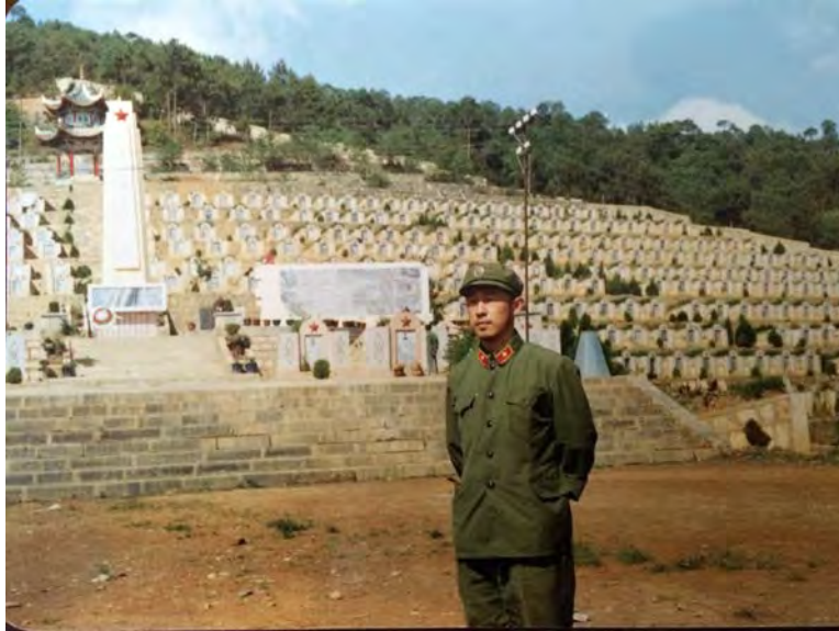
A PLA officer stands at the foot of a memorial located in Yunnan, China dedicated to the thousands of Chinese soldiers killed in the 1979 Sino-Vietnamese War.