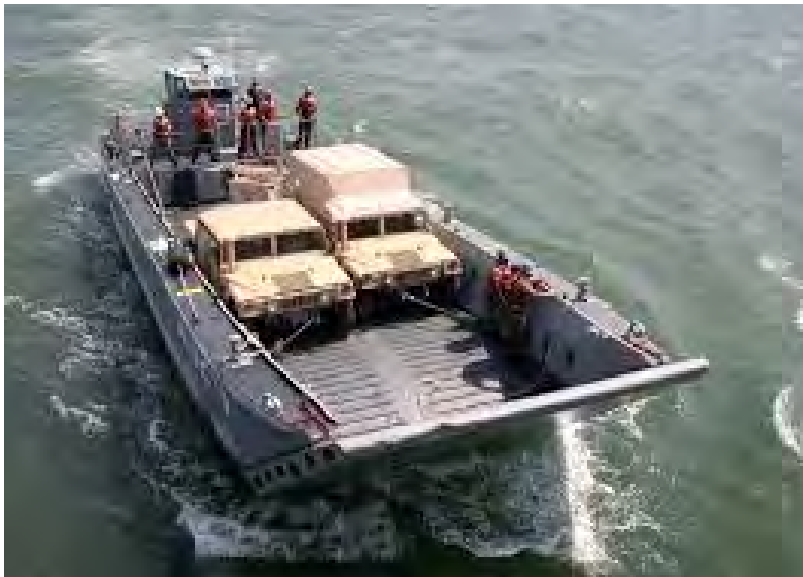
Figure 4. LCM-8 Laden with Cargo in Support of Hurricane Katrina Disaster Relief

short ton max payload capability of the LCM-8. A maneuver enhancing vessel must be capable of moving all types of ground maneuver forces and equipment in the Army inventory. Additionally, the lack of a stern ramp on the LCM-8 requires vehicles to back onto the vessel which increases the time necessary to load vehicles aboard the LCM-8. A vessel with both bow and stern ramps allows vehicles to drive through the vessel from stern to bow, decreasing loading time that is critical when making multiple lifts with the same vessel. Finally, at 9 knots and 5 feet of draft while laden, the replacement to the LCM-8 should have better speed and a shallower draft. 22 (See figure 4) Subject matter experts in CASCOM coined the term Maneuver Support Vessel Light (MSV(L)) as a concept boat “with increased capabilities that would replace the current LCM-8, a 40-year old Vietnam era boat.” 23 This research will continue to utilize the acronym MSV(L) when describing a replacement vessel for the LCM-8.