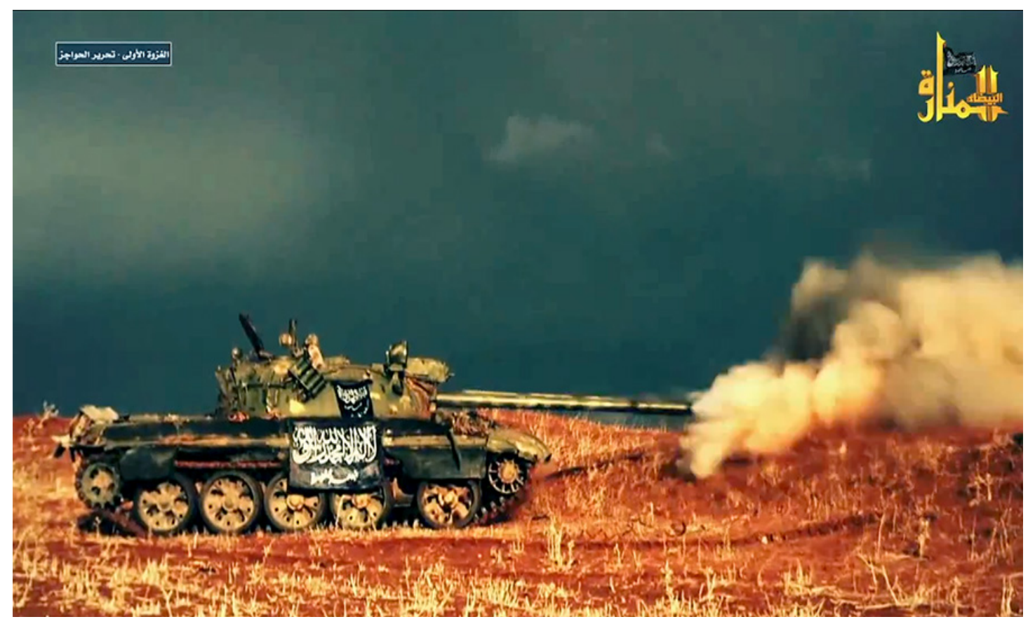
In this image from a jihadi video, a tank operated by Jabhat al-Nusra fires on a target in northern Syria.