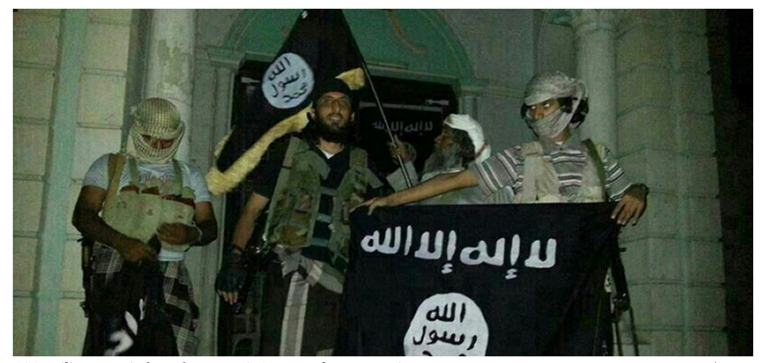
AQAP militants pose in front of a museum in Sayun, Hadramawt province, Yemen.