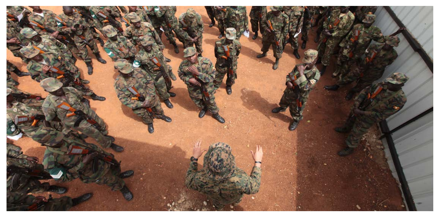
A U.S. Marine trains Ugandan soldiers for the fight against al-Shabab.