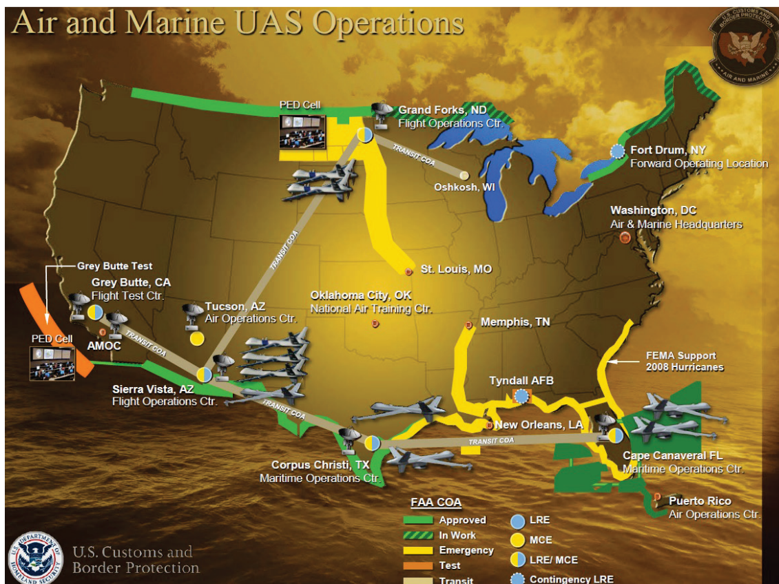
Figure 3.1 U.S. Customs and Border Protection Air and Marine Unmanned Aircraft Systems Operations