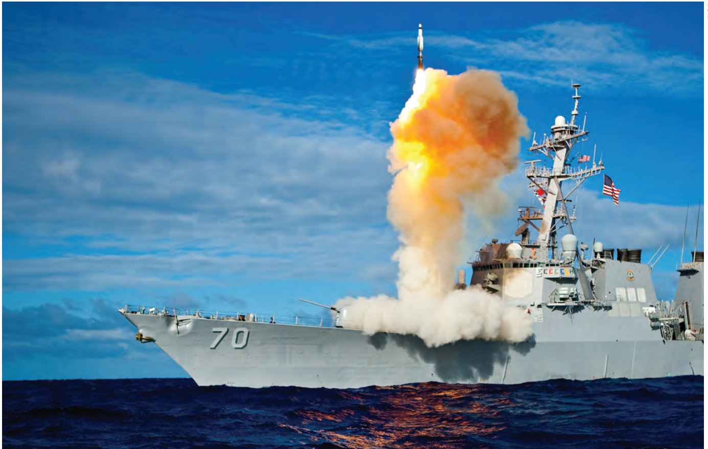
Arleigh Burke -class guided missile destroyer USS Hopper (DDG 70), equipped with Aegis integrated weapons system, launches RIM-161 Standard Missile

through a small number of human-to-human messages on which dispersed forces could execute preplanned objectives. This focused view kept protected communications capability development geared toward the “Armageddon” context and did not significantly influence tactical requirements.