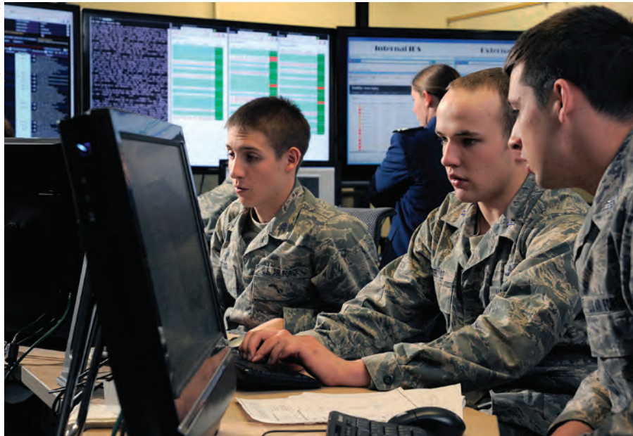
Air Force cadets defend their network during National Security Agency's Cyber Defense Exercise at U.S. Air Force Academy, Colorado Springs

Potential adversaries have a variety of options to accomplish disruption including physical destruction of satellites and ground stations, cyber, and jamming. Jamming is an important element of any communications-denial plan. It is cheap to obtain and simple to operate. It can effectively be used surgically or in broadly based attacks. The absence of planning and programmatic actions to protect against a jamming threat is worrisome given the likelihood of its use.