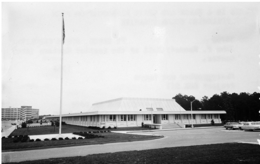
Figure 19. The newly constructed John F. Kennedy Hall at the Special Warfare Center, Fort Bragg, North Carolina, 1966.

The Special Warfare Center at Fort Bragg was expanded in 1965 to accommodate the expanded mission of the 5 th Special Forces Group (Airborne) that was activated in 1961. The headquarters and academic buildings that comprised the complex were COIN training facilities used to prepare troops to train the Republic of South Vietnam's government and military personnel to resist communist influences. 181 Figure 19 shows the John F. Kennedy Hall at the Special Warfare Center in 1966. Fort Gordon also conducted COIN training (Figure 20).