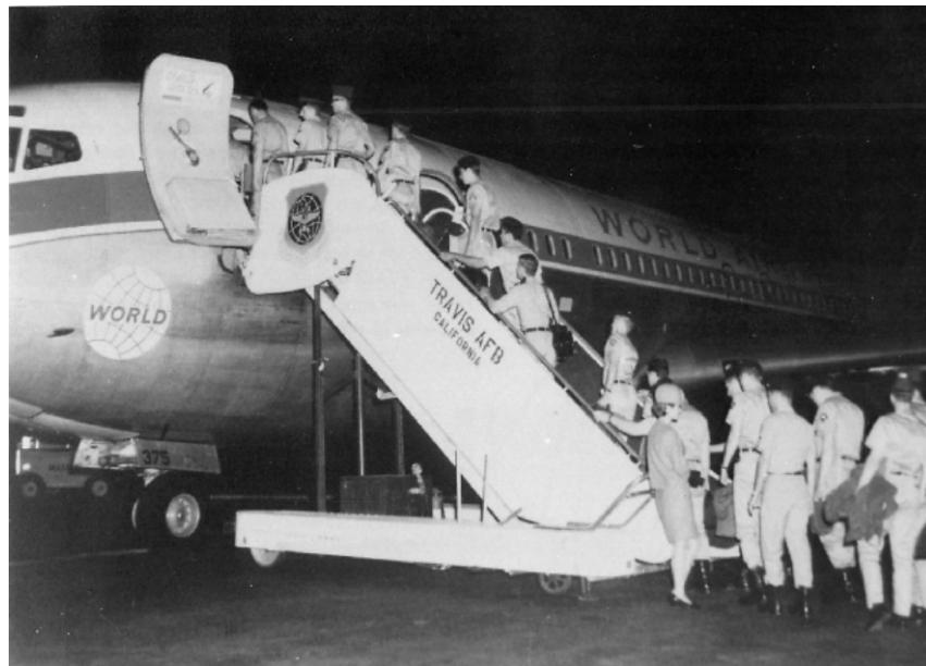
Figure 72. Army Troops board commercial flight from Travis AFB to Vietnam, ca. 1968.

Travis AFB became the primary West Coast aerial port for troops and supplies heading west to support the war and for those returning to the United States. Between 1965 and 1975, Travis AFB would remain the DoD's busiest military port. Travis would provide facilities for virtually every aspect related to military airlift during conflict, including aircraft and associated maintenance structures, storage for all types of supplies in warehouses and in open areas, refueling operations, passenger facilities, cargo-handling capabilities, and the associated administrative offices. The refueling operations included support for moving fighter aircraft and B-52 bombers to the conflict zone. 453