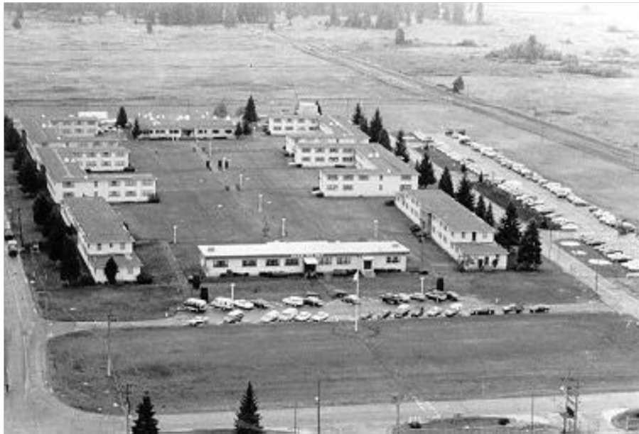
Figure 64. The USAF Survival School complex at Fairchild AFB, Washington, in 1966.

The Survival School was run by the 3636th Combat Crew Training Group (Survival) (CCTG) under the Air Training Command (ATC). The training unit was established on 1 March 1966 at Fairchild AFB (Figure 64). 399 At that time, training in survival techniques was spread over nearly 100 training schools in the Air Force. For example, in addition to the schools at Clark AFB and Albrook AFB, there was a TAC Sea Survival School at Homestead AFB, Florida. On 1 April 1971, all training was consolidated under the newly organized 3636 th Combat Crew Training Wing (Survival), ATC at Fairchild AFB, which was now responsible for the entire Air Force. 400 Curricula at the Fairchild AFB USAF Survival School included basic combat survival and survival instructor courses. A helicopter detachment was added in 1971, as the Air Force had determined that “85 percent of downed aircrews were rescued within six hours after bailout.” 401 The wing also played a role in debriefing the POWs returning from Vietnam. Once the U.S. military had left Vietnam, the ATC closed both the tropic and jungle survival schools in 1975. 402 Survival training is still conducted at Fairchild AFB.