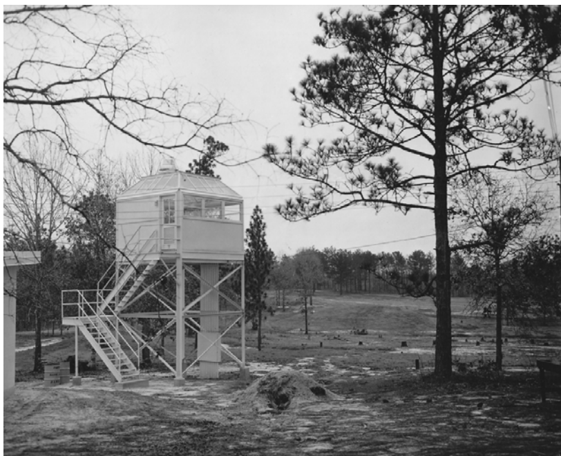
Figure 7. Range 34B was an example of one of the latest and most modern ranges on Fort Polk, Louisiana, January 1968.

Training at outdoor ranges also included classroom work in reused buildings (Figure 8). However, classes were not always taught in classrooms; Figure 9 shows a machine gun class held outdoors. Outdoor range infrastructure also included bunkers and other shelters (Figure 10).