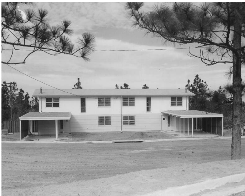
Figure 39. New Officers' Quarters at Fort Gordon, 1966 (Office of the Signal Corps Historian).

figured importantly as a career incentive. Ultimately, the Army hoped to provide adequate permanent housing for all military personnel at permanent installations (Figure 39). The housing deficit in 1965 still exceeded 13,000 officer spaces. 201 By 1971, family housing quarters were being leased from the private sector at Fort Carson on an experimental basis, and additional resources were being sought to overcome a backlog in deferred family housing maintenance. 202 New administrative facilities for managing installation family housing were also constructed.