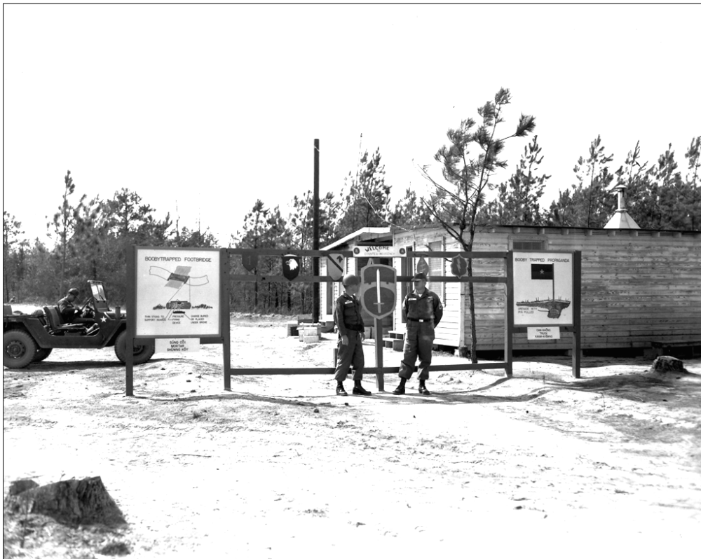
Figure 20. Counterinsurgency training at the COIN headquarters at Area 18, Fort Gordon, Georgia, March 1966.

The Civic Action Program was established as early as 1961 to encourage the utilization of indigenous forces to assist local populations with development projects that improved living conditions. Through such community building, the U.S. military developed support in localities, which helped prevent the development of insurgency. Military personnel involved with the Civic Action Program were trained at the U.S. Army Civil Affairs School at Fort Gordon. 182