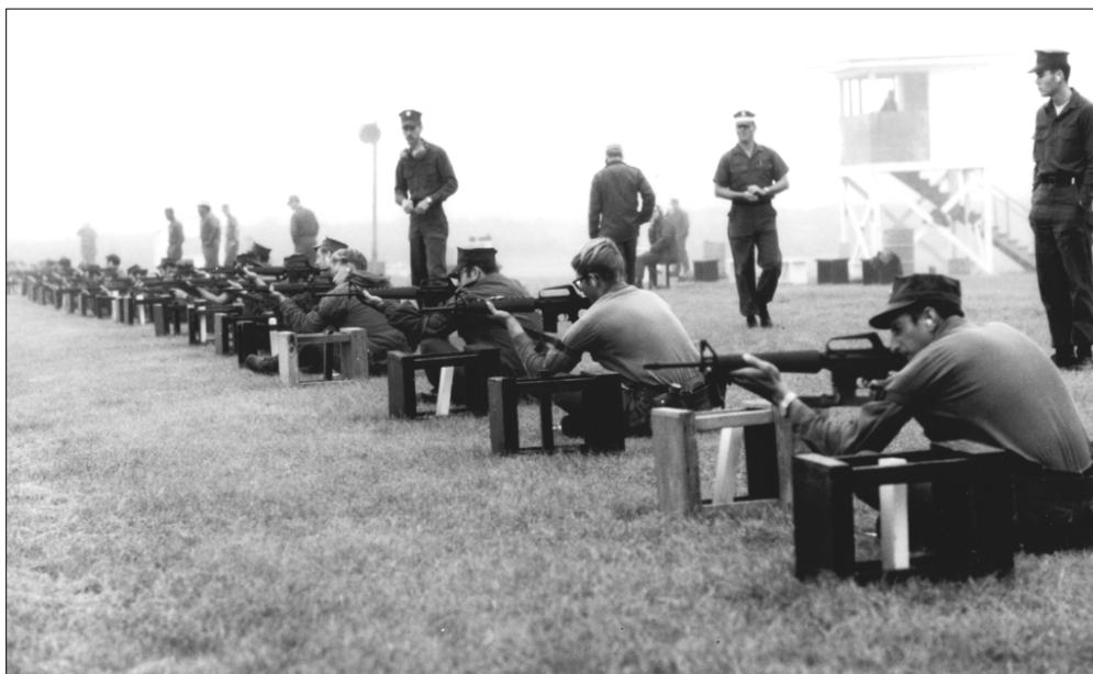
Figure 47. Naval trainees on the rifle range at the U.S. Naval Construction Battalion Center, Gulfport, Mississippi, 1970 (Loose Print file, Navy Photo Library, Washington Navy Yard).

In 1965, training in aviation and submarine programs remained a top priority for the Navy as the intensified demands of Vietnam were felt throughout the military. In support of these training programs, facilities for the second increment of construction at the Fleet Ballistic Missile (FBM) Submarine Training at Charleston, South Carolina, were almost