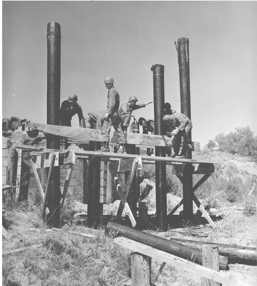
Figure 6. Men of the 7 th Engineering Battalion, 5 th Infantry Division at Fort Carson, Colorado, construct a wood bridge across a stream bed as part of their training exercises, June 1962.

As stated previously, rifle marksmanship was adapted to train troops to rapidly shoot at objects in close proximity, instead of the distance approach previously utilized. Rifle ranges were reconfigured for this technique. Reconfigurations were reflected with construction of more-refined range control tower structures (Figure 7), and some featured wide-angle views.