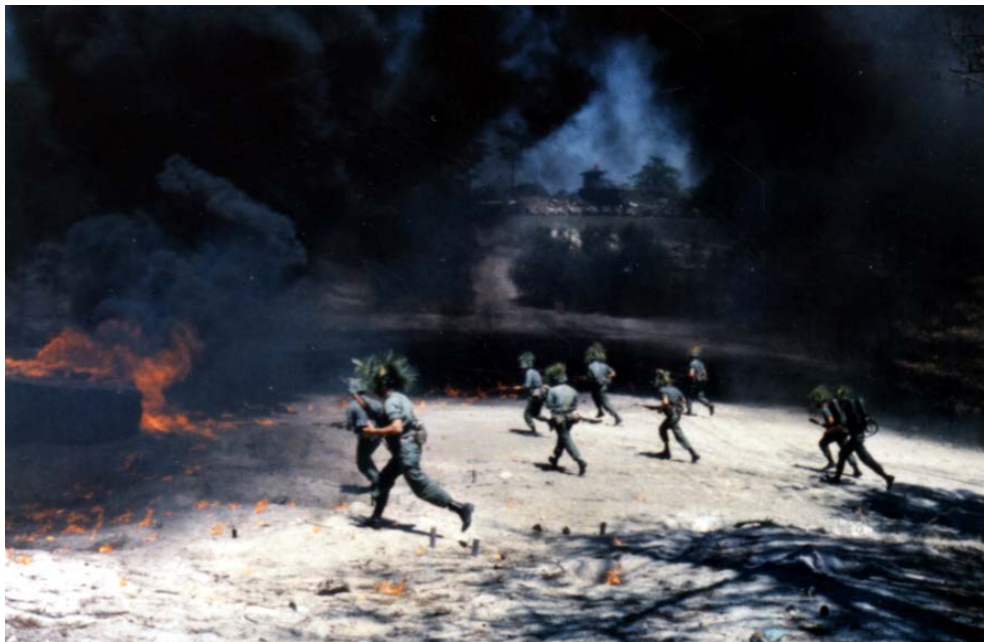
Figure 57. Marine Riflemen move in for the final phase of an assault demonstration at Camp Lejeune, North Carolina, 1969 (NARA 127-GG-601-A704412).

The majority of Marine training for Vietnam was conducted at Camp Pendleton, Camp Lejeune, or Quantico Marine Corps Base (MCB), however more specialized training was conducted at other Marine bases (Figure 58). For example, the Marine Corps Recruit Depot, San Diego, California, gained five new recruit barracks and a dining hall to more efficiently serve the trainees in 1967. In addition to recruit training, the Marine Corps Recruit Depot also offered formal courses in instructor and NCO leadership. 340