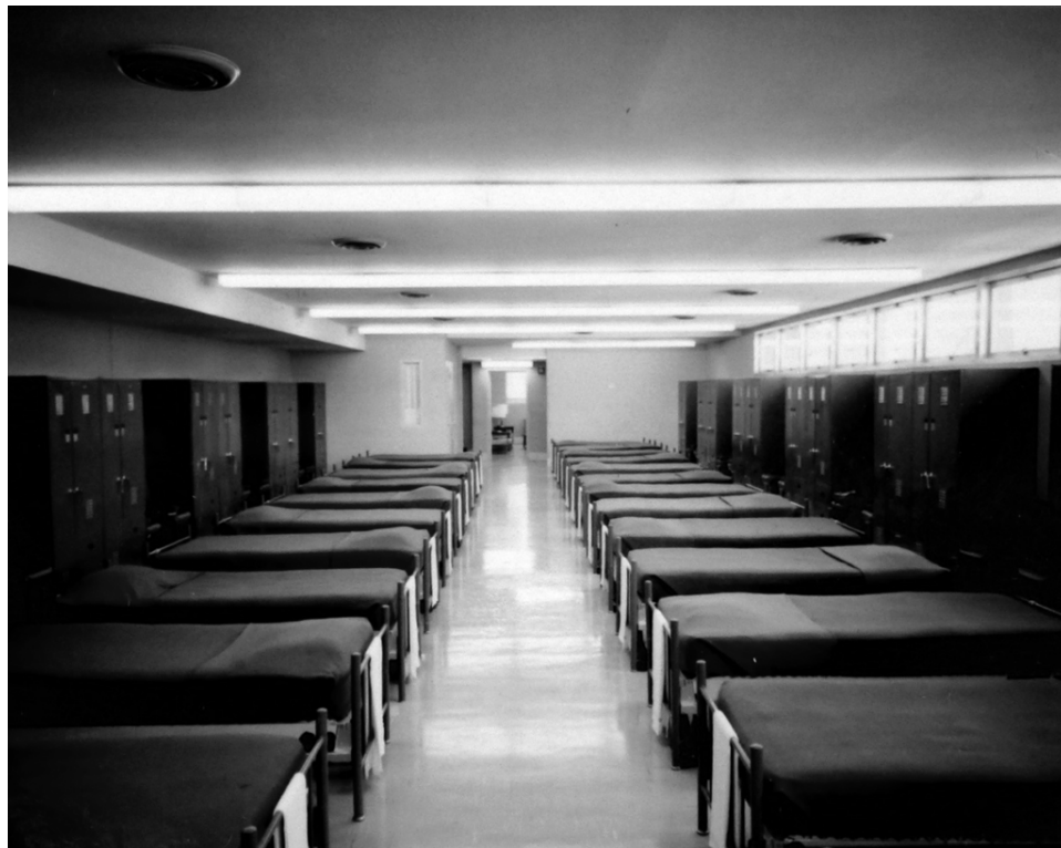
Figure 66. Interior of a common-room barracks at Lackland AFB, Texas, October 1968.

Additional construction on the east side of Lackland AFB was accomplished in 1971 when the main Base Exchange complex was built on an area where 109 WWII barracks had stood before being torn down between 1966 and 1971. On the west side of Lackland AFB, contractors built more facilities for recruit housing and training during that same time period. Gaining permanence had become a priority by 1976, as seen from the rapid removal of temporary buildings. 410