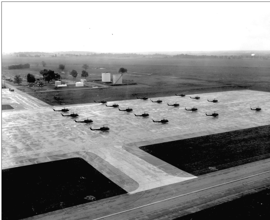
Figure 14. Apron at Campbell Army Air Field showing Model UH-1C helicopters prepared for training mission, August 1967.

Of particular importance was the development of the helicopter schools that were part of the airmobility concept, a concept that fell under the Army's mission and not the Air Force's. The airmobility concept was the chief modification of the Army's force structure during Vietnam. Airmobility was developed as a solution to the guerilla warfare waged by the Viet Cong. Airmobility, in its broadest sense, envisaged the "use of aerial vehicles organic to the Army to assure the balance of mobility, firepower, intelligence, support—and command and control." 178 Figure 14 and Figure 15 show helicopters used in training and being prepared for shipment to Vietnam.