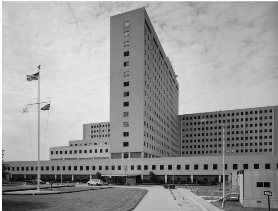
Figure 53. Portsmouth Naval Hospital, Virginia, 1960 (Library of Congress, HABS VA 65-PORTM, 2-12).

Navy hospitals were started at Long Beach and Oakland, California, and at Jacksonville, Florida. 305