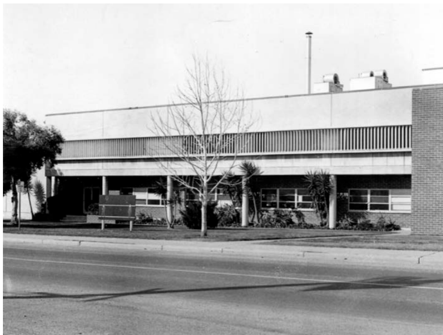
Figure 60. Station training building at Marine Corps Air Station El Toro, Santa Ana, California, 1972 (NARA MC 127-GG Box 1 A149698).

Marine Corps Air Station Yuma, Arizona, was operationalized by the Marines in 1962. The airfield featured aerial gunnery ranges spread over 3 million acres. It also had three bomb and rocket targets, three remote strafing targets, and eight banner strafing targets that were used for training by aviators from all services for missions in Vietnam. 347 Other air stations provided training as well, such as Air Station El Toro (Figure 60).