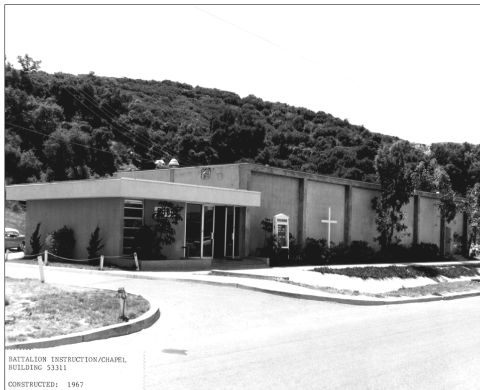
Figure 62. Chapel at Camp Pendleton, California, built in 1967.