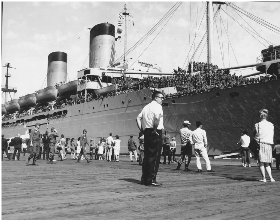
Figure 44. Troops of the 4 th Infantry Division, Fort Lewis, Washington, are shown onboard the military sea transport service troop ship—General George Pope, at Pier #1 at the Port of Tacoma, WA, September 1966 (NARA SC 633237).

Most cargo traveled to Vietnam by sea through the military sea transport service, which also transported personnel, although most traveled by air (Figure 44). Materiel was shipped from vendors or depots directly to U.S. West Coast military ports or airfields, or directly to commercial ports. From these locations cargo either traveled directly to South Vietnam or to Okinawa. The first stop in South Vietnam was either the port at Saigon or the Tan Son Nhut airport. 232 Delivery farther in-country was by water or air.