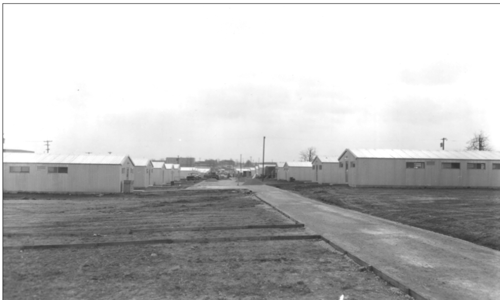
Figure 34. Prefabricated metal troop housing at Fort Leonard Wood, Missouri, November 1966 (NARA SC635541).

In addition to WWII barracks, prefabricated buildings were quickly assembled to accommodate the increased troop levels (Figure 34 and Figure 35).