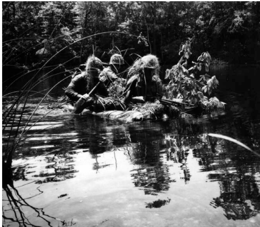
Figure 58. A reconnaissance element from “I” Company, Third Battalion, Sixth Marines crosses a stream on a raft constructed for recon type training, Camp Lejeune, North Carolina, undated.