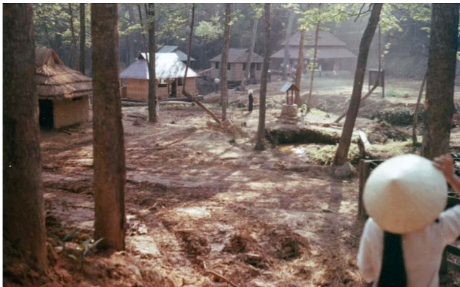
Figure 59. Overall view of the Southeast Asian Village constructed at the Basic School, Quantico, Virginia, June 1966 (NARA 127-GG-957-A556414).

The town included two gun pits, hidden demolitions, and a concrete-block tunnel with concealed entrances. The new layout provided students in the Infantry Training School an environment where they learned urban assault and combat in built-up areas. 344