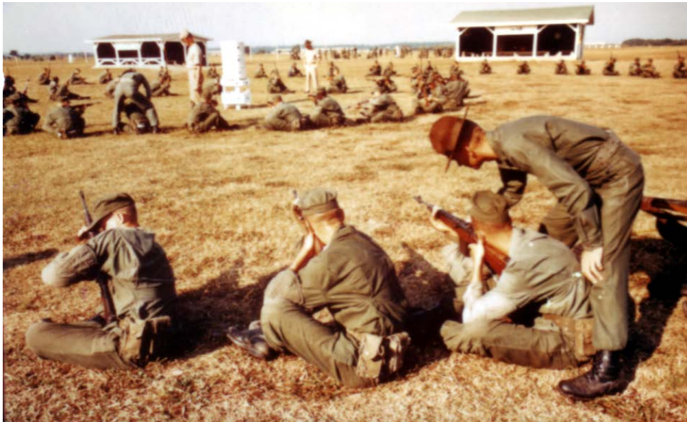
Figure 56. Recruits at Marine Corps Recruit Depot Parris Island, South Carolina, begin instruction on the rifle range, 1967.

Realignments in training took place for officers, as well. In 1966, the Marine Corps Basic School for newly commissioned officers was temporarily reduced from 26 to 21 weeks. The Amphibious Warfare School for majors and captains was also temporarily reduced from 42 to 21 weeks. The reductions were made by eliminating the subjects that were nontactical in nature. The reductions allowed an approximate doubling of professionally trained officers per year who were available for duties in the Fleet Marine Forces. 336