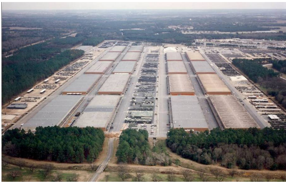
Figure 63. Aerial view of MCLB Albany warehouse area, ca. 1970 (Public Works Office, MCLB Albany).

same functions for the forces east of the Mississippi River and for the Fleet Marine Forces in the Atlantic (Figure 63). The Albany installation was commissioned in March 1952 as the Marine Corps Depot of Supplies. By 1954, construction was almost complete with the requisite warehouses and administration buildings, and supply duties began. In 1967, new activities were added—a Storage Activity and a Depot Maintenance Activity. The base played a role in professional education, training Marines in maintenance and supply tasks through formal courses. 373