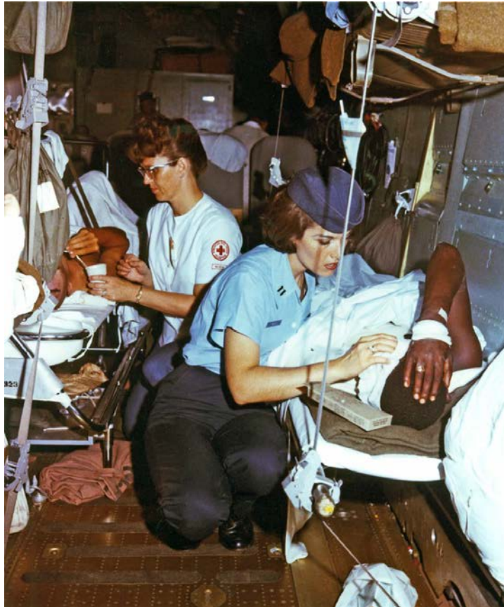
Figure 68. An Air Force nurse and a Red Cross nurse attend to patients aboard an Air Force C-141 for an evacuation flight from Vietnam to the U.S., 1967.

Throughout the war, many of these patients were either treated or transited through Travis AFB. During the Vietnam War, Travis assumed responsibility as the West Coast terminus for MAC aeromedical transports. In fact, throughout the Vietnam War, wounded troops were most often transported to Travis AFB. The spring of 1968 recorded increasing arrivals of wounded (sometimes over 5,000 per month), at Travis, with the David Grant USAF Hospital receiving an average of 4,070 patients a month throughout 1968. 425 At the height of this effort, over 9,000 patients (all injured during the February 1969 TET Offensive) were