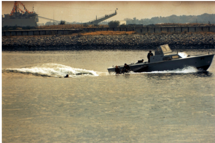
Figure 51. On Chesapeake Bay, a large personnel landing craft of Coastal River Squadron 2 tows an inflatable boat on the way to picking up a SEAL team member during riverine training, December 1973.