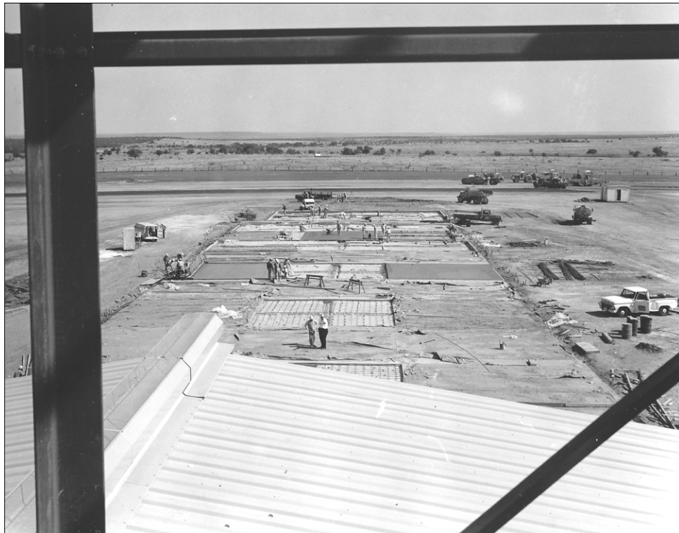
Figure 16. A view from the unfinished control tower above West Heliport's main hanger showing the construction of the north wing bay maintenance area at Fort Wolters, Texas, August 1967.