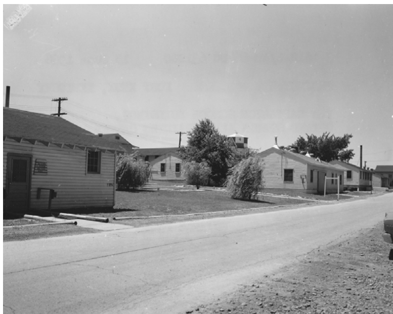
Figure 26. The 7 th Battalion School at the USATC, Armor, Fort Knox, Kentucky, utilized older buildings, June 1966.

Many schools and academic complexes were located in existing buildings even well into the 1970s. Figure 26 shows part of the complex of buildings that made up the campus of the 7 th Battalion School at the U.S. Army Training Center (USATC), Armor, on Fort Knox. Figure 27 shows a repurposed Hammerhead barracks as headquarters for the First U.S. Army Non-Commissioned Officer (NCO) Academy, also at Fort Knox.