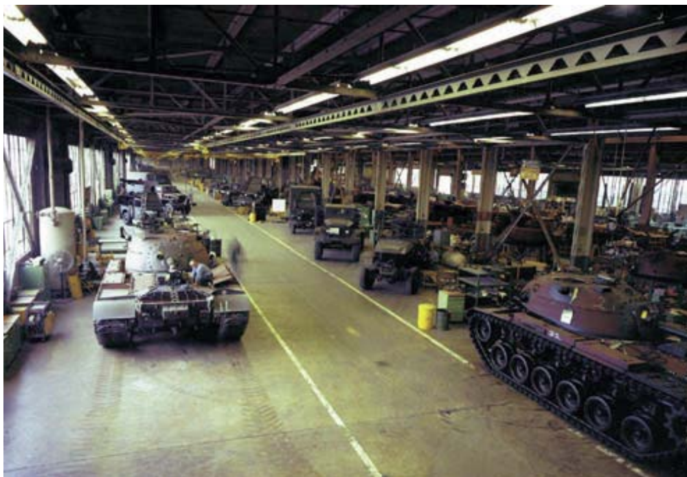
Figure 46. Tracked and wheeled vehicle refurbishment, Letterkenny Army Depot in Pennsylvania, 1960s.