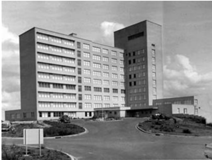
Figure 70. Wilford Hall Medical Center, Lackland AFB, Texas, 1957.

The 100-bed hospital at Travis AFB was opened in 1949, and it expanded during the Korean War with a new wing and 200 more beds. The Vietnam War brought more hospital expansion to the newly christened David Grant USAF Hospital at Travis (Figure 71), with another addition built during 1966–1967. This $700,000 project included a new dental clinic and about