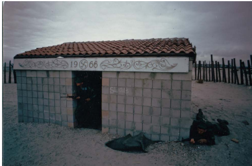
Figure 49. Concrete block structures were also part of Dragon Village. A Navy mock-up Vietnamese settlement used in SEAL team training exercises at Coronado, California, February 1968.