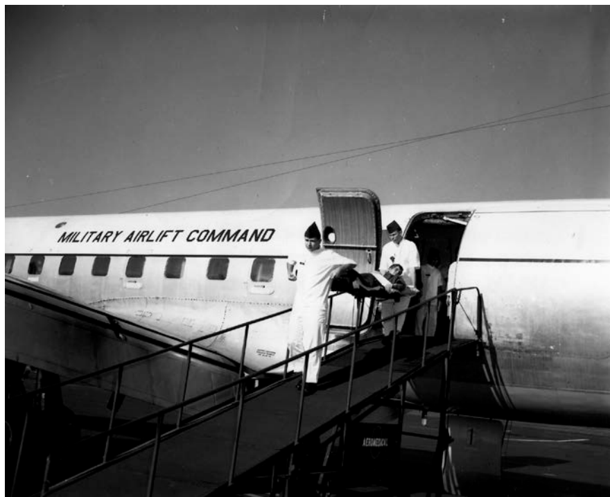
Figure 67. MAC returns a former POW of the Viet Cong to Fort Campbell, Kentucky, November 1969.

Air Force Nurse Corps personnel arrived in South Vietnam in early 1966 and were assigned to the 12 th U.S. Air Force Hospital in Cam Ranh Bay. Later arrivals saw duty serving within South Vietnam in aeromedical evacuation squadrons and in dispensaries throughout the area. Additionally, Air Force nurses served on the evacuation flights from South