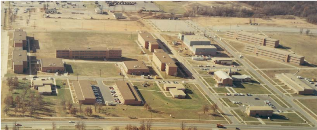
Figure 33. A portion of a typical Vietnam-era barracks complex at Fort Leonard Wood, Missouri, but also found on many Army posts throughout the country. This photo shows half of the complex with barracks, mess halls, battalion headquarters/classrooms, and company administration buildings on the left with gymnasium, branch post exchange, branch medical clinic, chapel, and brigade headquarters on the right. The other half of the complex is to the right off the photo (Fort Leonard Wood History Office).

In addition to WWII barracks, prefabricated buildings were quickly assembled to accommodate the increased troop levels (Figure 34 and Figure 35).