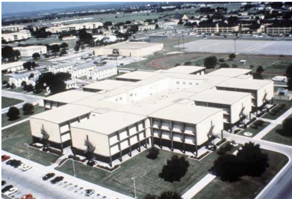
Figure 65. Recruit training and housing facility, Lackland AFB, early 1970s (37 th Training Wing).

Although not a technical training center, Lackland AFB saw nine similar recruit training and housing facilities constructed on base during the 1960s. Each building housed 1,000 personnel and included spaces for dining halls and classrooms. The buildings had 10 wings that each housed one squad of 100 recruits in open rooms with communal toilets (Figure 65). The buildings were constructed so that outdoor training could be conducted under the wings that were cantilevered over a concrete pad. 409 Even throughout the late-1960s, the Air Force continued to rely on common-room barracks because of the increase in troop levels (Figure 66).