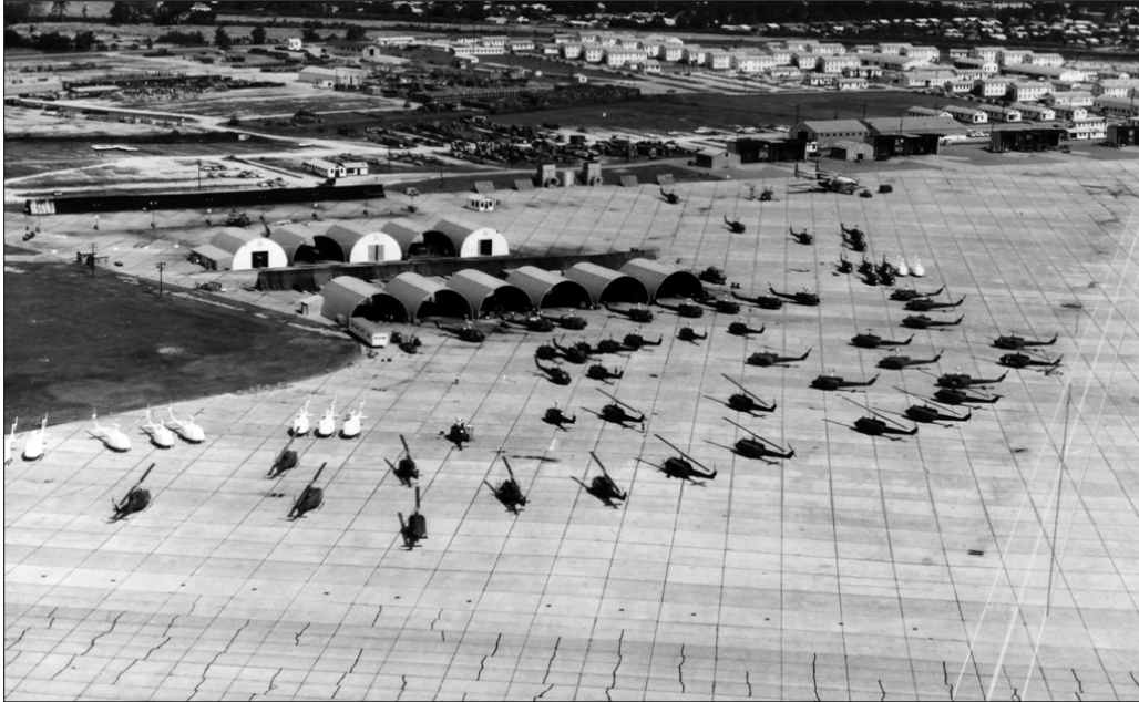
Figure 15. The First Cavalry (Airmobile) Division's helicopters sit on the ramp at Air Force Logistics Command's Mobile Air Material [sic] Area at Brookley AFB, Alabama. The helicopters have been sea-sprayed in the hangars in preparation for being loaded on ships headed for Vietnam, November 1965 (NARA RG 342-B).