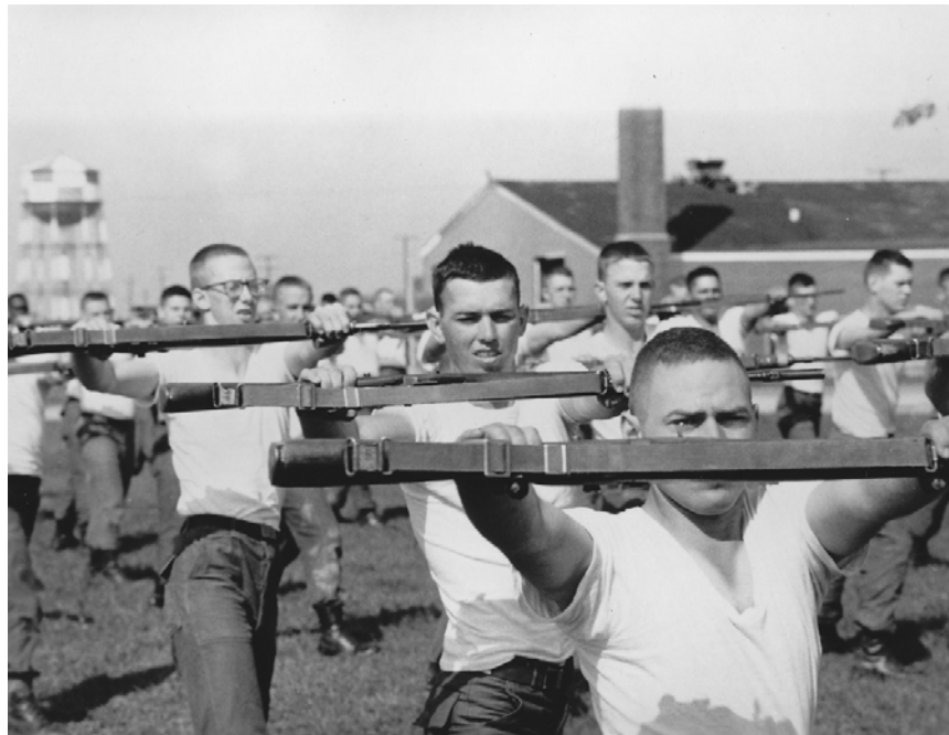
Figure 4. Trainees undergo physical training with a rifle at Fort Campbell, Kentucky, September 1968 (NARA SC646960).

The challenges presented by the conditions in Vietnam heavily influenced how the Army trained, equipped, and deployed its forces. For example, the emergence and reliance on aviation technology through the use of