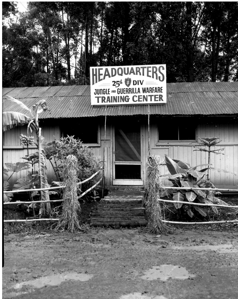
Figure 21. The Headquarters building of the Jungle and Guerrilla Warfare Training Center, 25 th Infantry Division at Schofield Barracks, Hawaii, May 1962.

The Army's 25 th Division established a combat training center in 1941 at Schofield Barracks, Hawaii. By the early 1960s, it was the Army's premier counter-guerrilla training center where courses were taught on jungle survival, warfare, and military tactics including rappelling from helicopters and cliffs, and Asian languages. 184 The center had the appearance of many of the Army's other mock Vietnamese villages (Figure 21 and Figure 22).