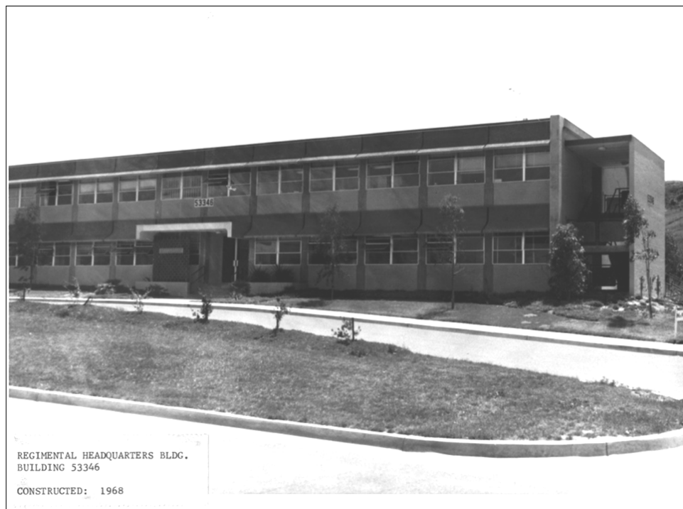
Figure 61. Regimental Headquarters-1 st Marines at Camp Pendleton, California, constructed in 1968.

In the late 1960s, plans were approved at Camp Pendleton for a 64,000 square-foot, pre-cast concrete base headquarters building (Building 1160). Eventually costing $1.2 million, the building was located on Vandegrift Boulevard. 363 Other headquarters constructed at Camp Pendleton were the Regimental Headquarters (Figure 61).