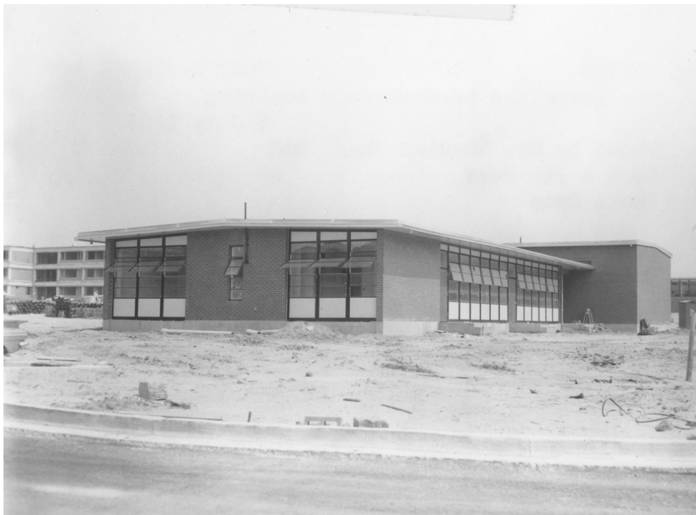
Figure 36. The new battalion headquarters building at Fort Dix, New Jersey [this standardized plan can be found at most Army installations], July 1968 (NARA SC646736).

A then newly constructed battalion headquarters at Fort Dix is shown in Figure 36. Other headquarters were retrofitted into existing buildings, as at Fort Polk, LA (Figure 37) while others were new construction (Figure 38).