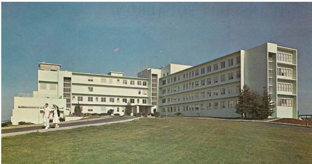
Figure 71. Travis Air Force Base hospital complex in 1966 (60 th AMW Historian).

100 more beds for the casualty staging unit adjacent to the main hospital building. 431