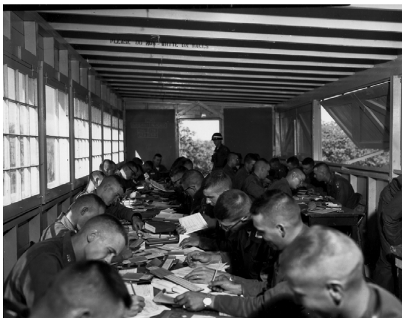
Figure 8. Soldiers trained in existing range classroom facilities at Fort Sill, Oklahoma, October 1966.

Training at outdoor ranges also included classroom work in reused buildings (Figure 8). However, classes were not always taught in classrooms; Figure 9 shows a machine gun class held outdoors. Outdoor range infrastructure also included bunkers and other shelters (Figure 10).