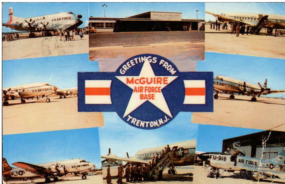
Figure 74. Early 1960s card showing MATS transport on the airfield at McGuire AFB, New Jersey.

McGuire AFB, New Jersey, was the East Coast partner to Travis AFB in terms of troop and supply transport roles during the Vietnam War, serving the 21st Air Force. 462 McGuire AFB transported troops and supplies to South Vietnam in vast quantities, and it was the largest air port on the East Coast (Figure 74). In 1973, POWs from North Vietnam were airlifted to McGuire AFB.