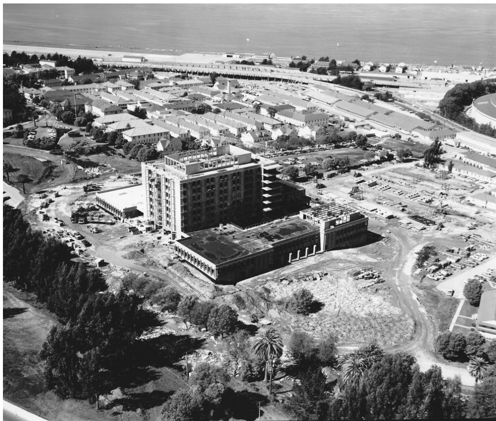
Figure 40. Aerial view of Letterman General Hospital while under construction, Presidio of San Francisco, California, March 1967.

returning former POWs in February 1973 (Figure 41). 221 Letterman Army Medical Center was another of the centers, and it welcomed home nine former POWs in 1973. 222