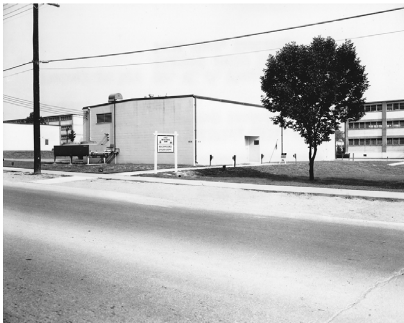
Figure 28. Exterior view of Building 6536, classroom in former barracks complex, First U.S. Army NCO Academy, Leader Preparation Course, Fort Knox, Kentucky, July 1967 (NARA SC641556).

Other classrooms were located in smaller buildings within former barracks complexes (Figure 28). The U.S. Army Intelligence Center and School was moved to Fort Huachuca and located in existing buildings on the installation. As a result, the school has a variety of building types (Figure 29 and Figure 30).