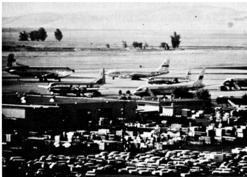
Figure 73. Travis AFB's crowded aerial port in 1967.

troops and 4,479 tons of equipment. 456 In the autumn of 1966, the Army's 1st Cavalry Division utilized the Travis AFB airlift capacity to transport approximately 9,000 replacement troops to Vietnam. This complex operation was facilitated by establishing an Army liaison team at Travis AFB to assist with scheduling. 457 While these large operations took place occasionally, there was a constant daily flow of personnel and materiel from Travis AFB to Southeast Asia. Between 1966 and 1970, over 5,579,000 passengers and 1,097,924 tons of cargo were processed at Travis AFB (Figure 73). 458