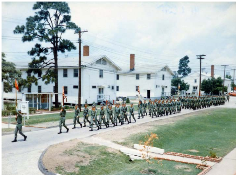
Figure 32. Training activities at Fort Gordon, Georgia, showing reused WWII temporary buildings in the background, June 1966.

The reuse of WWII barracks was common throughout the Army, even as barracks modernization campaigns were underway (Figure 32). These new barracks complexes usually included a brigade headquarters building, a battalion headquarters building, company administration buildings, barracks, classrooms, mess halls, a chapel, a branch PX, a branch medical clinic, and a gymnasium (Figure 33).