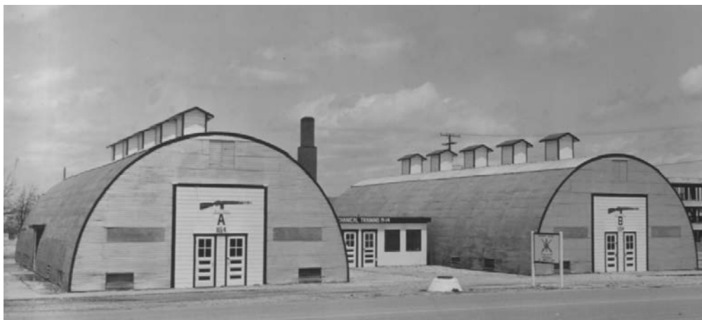
Figure 5. Early 1960s Mechanical Training building, utilized for classroom weapons training, Fort Leonard Wood, Missouri, April 1966 (NARA SC632484).

The increasing demand for troops in Vietnam led to rapid expansion of the Army's basic combat training infrastructure. Although there was a rapid