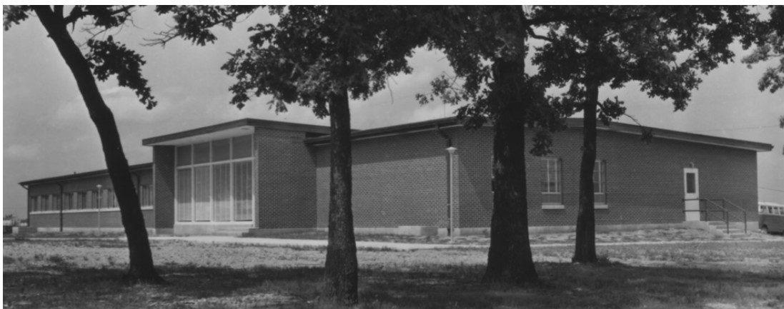
Figure 42. The newly constructed Boak Dental Clinic at Fort Leonard Wood, Missouri, 1965 (NARA SC619439).

As mentioned previously, improved dental care was another initiative by the military to recruit and retain personnel during the Vietnam War period. Advanced dental research and new dental clinics were part of the modernization of the Army's dental care. As part of this effort, a new dental clinic was completed at Fort Leonard Wood in 1965, and another was completed at Fort Polk in 1972, constructed in an area of WWII temporary buildings still in use (Figure 42 and Figure 43).