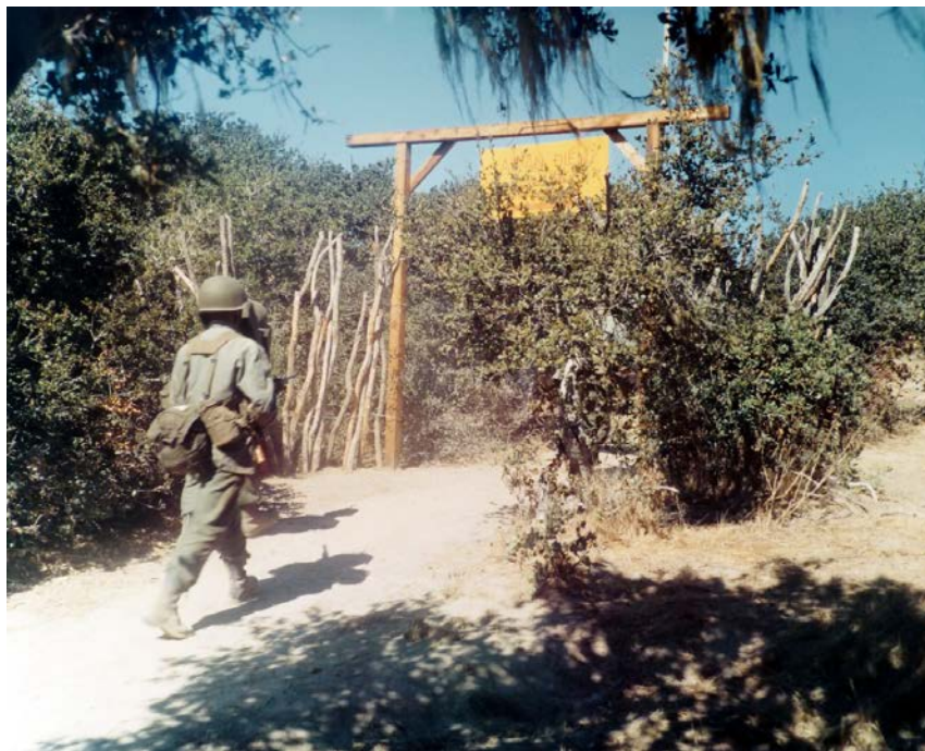
Figure 11. Training at the man-to-man training area at Fort Ord, California. The men used BB guns on the defense and on the attack, September 1969 (NARA RG 111-CCS).

Fort Devens, Massachusetts, had a mock Viet Cong village for training that was integral in the training conducted there. The training focused on enemy tactics, booby traps, and the locations of weapons in the training area. The mock village was set up by the Army Security Agency.