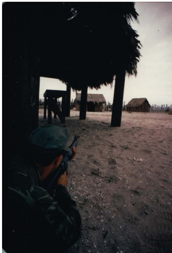
Figure 48. Thatched structures were part of Dragon Village, a Navy mock-up Vietnamese settlement used in SEAL team training exercises at Coronado, California, February 1968 (NARA RG 428-GX Box 668-45262).

Like other military services, the Navy constructed a mock Vietnamese village for troop training. In the Navy, the mock village was used for advanced SEAL training rather than as a complement to infantry training as in the Army. Figure 48 and Figure 49 illustrate the Navy's mock village. Located on Naval Air Base Coronado, the mock village lacked the vegetated setting that the mock villages at Fort Polk featured. Nevertheless, the Navy's mock village featured permanent and semi-permanent structures made of concrete blocks or thatched grass.