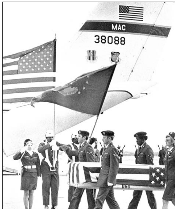
Figure 69. Return of Vietnam War dead to Travis AFB, c. 1973.

A grimmer duty also was conducted at Travis AFB during the war, as the base became the principal receiving station for war fatalities flown back for U.S. burial (Figure 69). According to records kept by the Travis Mortuary Affairs Office, 10,523 fallen servicemen passed through Travis AFB in 1968 alone. 428 Travis AFB served as the sole receiving station for Army war dead on the West Coast, accounting for 73 percent of the arrivals at the base. As of 1 July 1970, the Travis Mortuary Affairs Office was consolidated with those of other military services at the nearby Oakland Army Base, where all caskets arriving at Travis AFB were then transferred. 429