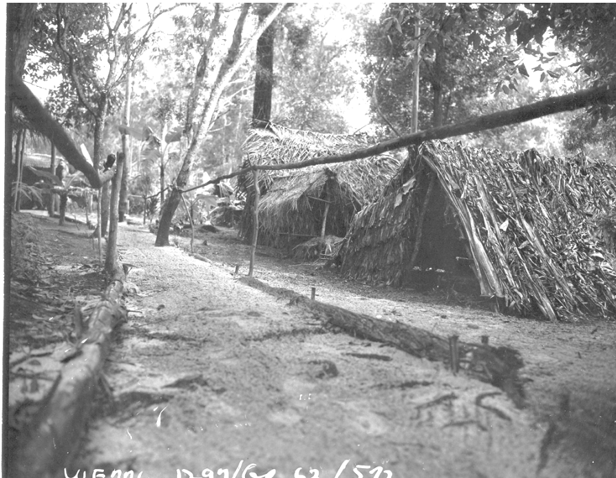
Figure 22. Station 3, Field craft and shelters at the Jungle and Guerrilla Warfare Training Center, Schofield Barracks, Hawaii, showing types of shelters, May 1962.