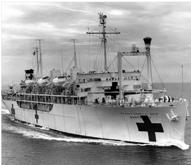
Figure 52. U.S. Navy Hospital Ship U.S.S. Sanctuary, undated.

The riverine warfare activities in Vietnam provided an example of the cross-service cooperation regarding medical service. The 9 th Medical Battalion of the 2 nd Brigade was part of the Army's 9 th Infantry, which in combination with two 50-boat Navy river assault squadrons formed the Mobile Riverine Force. A completely water-based unit, the Mobile Riverine Force was supported medically by the 9 th Medical Battalion, and they established the only Army medical facility in Vietnam based on a Navy ship. 294