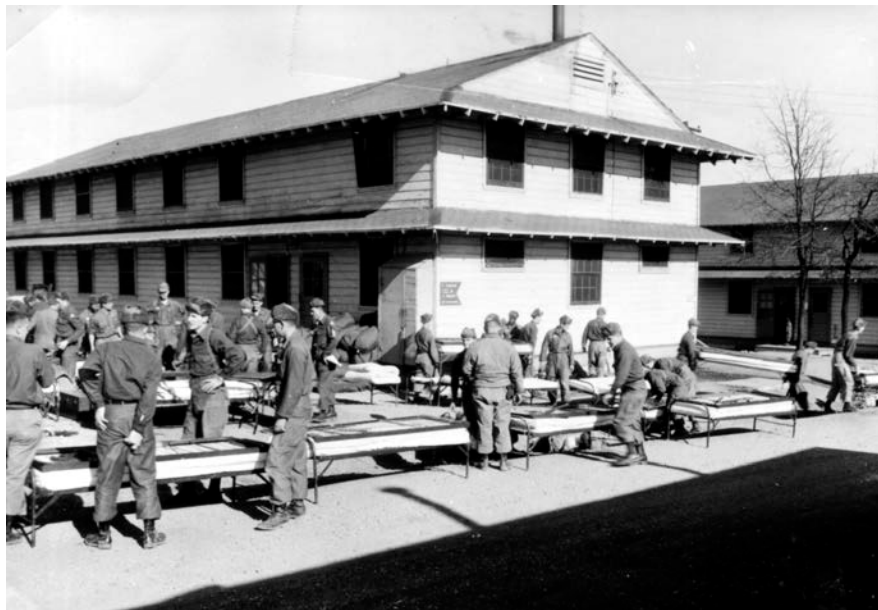
Figure 31. Trainees at Fort Leonard Wood, Missouri, are shown moving from a WWII barracks into a new permanent barracks, January 1961 (NARA SC591538).

During the Vietnam War, the housing stock at Army installations was overtaxed with the increase in soldiers. The majority of new recruits were housed in reconditioned WWII temporary barracks. The housing shortages not only illustrated the necessity of increased spaces, but also improvement in the overall housing stock as a retention incentive for officers and service personnel who had families. The improvements to the Army's housing stock began in the 1950s and continued into the 1970s. Nevertheless, the Vietnam War had a significant impact on housing construction budgets, units built, and the necessity of creating quality, on-base housing (Figure 31).