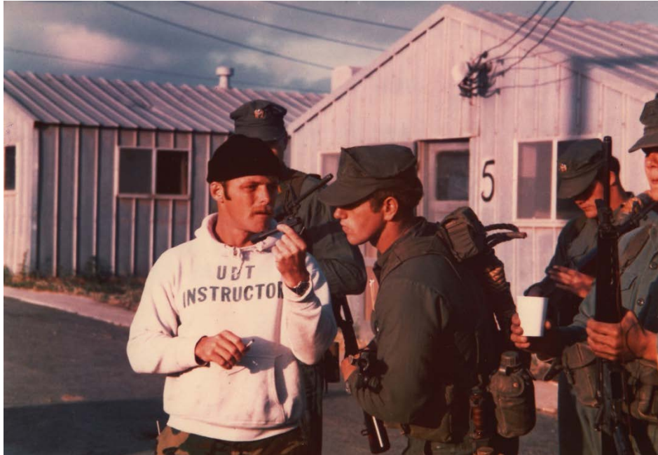
Figure 50. An instructor explains the method of firing the M-16 rifle to students of the basic underwater demolition SEAL training class at Naval Air Base Coronado, California [note prefabricated metal buildings in the background], March 1975.