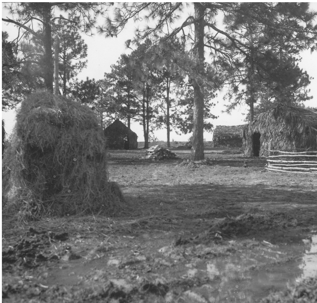
Figure 12. A purposely built mock village used in advanced infantry training at Fort Polk, Louisiana, January 1966.

Mock villages were designed and constructed to be as realistic as possible for recruit training (Figure 12). The interiors of the mock village structures were as detailed as the exteriors. The mock village at Fort Riley also featured structures made of organic materials. Fort Lewis had a detailed mock village that featured a Vietnamese shrine along with structures clad in grass. The Fort Lewis mock village also featured hidden tunnels, wells made out of stone, and concrete and semi-permanent structures made of timbers and stone. Often, the village training area would include a mock POW camp for use by soldiers (Figure 13).