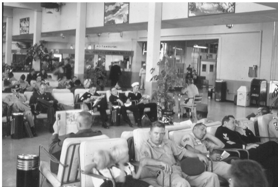
Figure 75. Passengers awaiting transport, air terminal, Travis AFB, California, 1960s

States made use of the facility. A 20,000 square foot addition was constructed in 1967, and the administrative and passenger check-in areas were remodeled that same year. A cafeteria was opened in the terminal in 1968, and a base exchange was opened across the corridor in 1970. 463