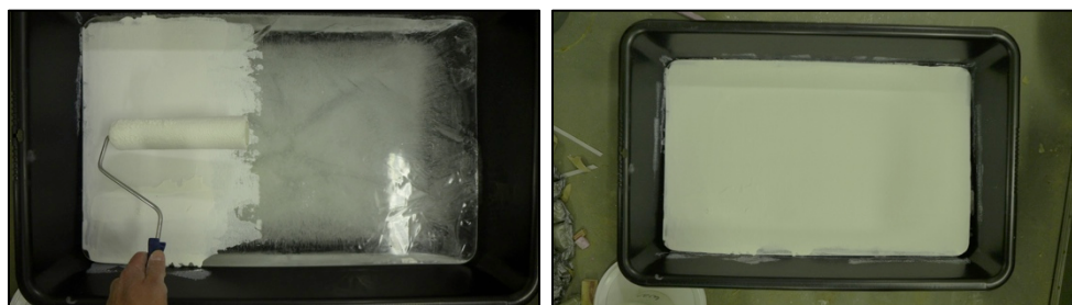
Figure 4. Application of White Ice paint to bare, fresh ice ( left ); and the ice surface following completion of rolling on the paint ( right ).

Figure 4 illustrates the application process of the White Ice paint and clearly shows the difference between the bare ice surface and the painted ice surface. Even with the “white” bubbles in the bare ice (as is typical in glacial ice), the paint provides a much more uniform surface