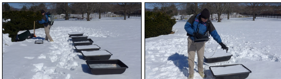
Figure 5. Collecting reference measurements from Spectralon white plate for normalization ( left ) and broad-spectrum reflectance from samples ( right ). Note that the 5-degree sampling cone was held at approximately 24 in.

Though it is possible to correct the plots to McMurdo radiation levels and to convert the results to albedos, that effort would likely result in minimal changes to the relative magnitude of improvement associated with the application of white ice paint and are unlikely to impact the findings of this narrow-scope concept study. This study is focused on the relative differences in reflectivity for the varying painted ice and compacted snow treatments.