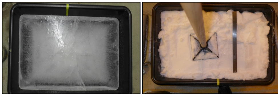
Figure 2. 3 in. thick, bare, fresh ice ( left ); and 3 in. thick, bare ice covered with 3 in. of compacted snow ( right ).

We chose black tubs so that they would absorb as much incoming energy as possible and thus have the least influence on outgoing (reflectance) values measured for each sample section. The two compacted snow depths represented incremental values above and below 4 in., which is generally accepted as the maximum penetration depth of solar incident energy in clean snow. Our object here was to establish whether or not the paint applied to the ice surface would have a significant impact on the reflectance of snow-covered ice less than 4 in. below the snow surface.