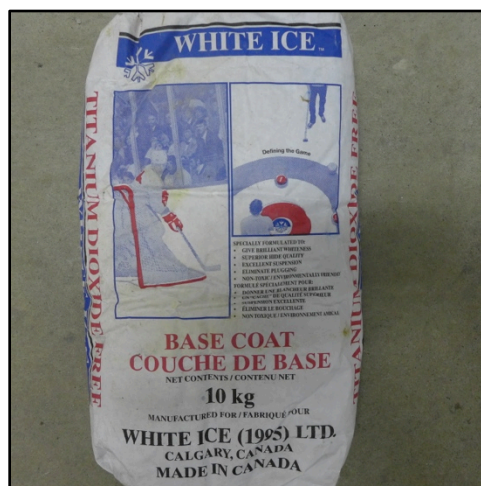
Figure 1. “Base Coat White” paint manufactured by White Ice LTD of Calgary, CA, and supplied by U.S. Arena Supply in Exeter, NH.

The U.S. Army Cold Regions Research and Engineering Laboratory (CRREL) obtained two 22 lb bags of a paint-powder product called “Base Coat White” manufactured by White Ice LTD of Calgary, CA, and distributed through U.S. Arena Supply in Exeter, NH (Figure 1). We chose the powder-based product over a liquid-based product because it is the most economical alternative for shipment to McMurdo should NSF-PLR recommend field trials. Though outside the scope of this small-scale study, water-based, pre-mixed paints with reportedly brighter and whiter properties are available and can be obtained and tested to compare against the powder-based paint.