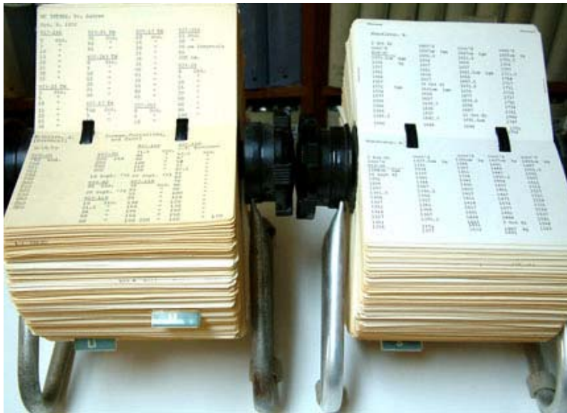
Figure 4. Fifty-five-year-old system of maintaining data. [These rollodex (plus many others) contain hundreds of thousands of typed records of sampling. They are presently being entered into an on-line sample history database.]