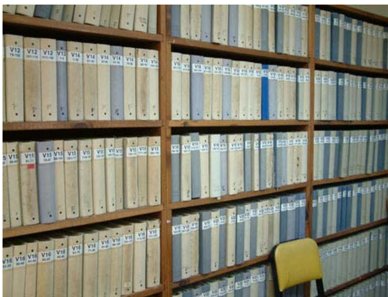
Figure 2. Lamont Core Repository library of analog core/dredge data [The core logs contain data of every core and dredge since 1947. There are several aisles containing over 1,000 of these volumes of analog photos, and typed or hand-written shipboard logs, opening logs and Megascopic Descriptions. All of this data has either been digitized and is on-line, or is currently being digitized for the web.]

An integral part of the function of the Core Repository is dissemination of information. Requests for information can be for core locations, cores in certain areas, photos, megascopic descriptions, the sampling history of a core or suite of cores, data, publications on cores, on-going research and so much more. Other than the Lamont Core Database of metadata on the cores, which has been in existence for well over 30 years, historically, other data has been produced by a laborious search through old hand-written or typed files of data (Fig. 2).