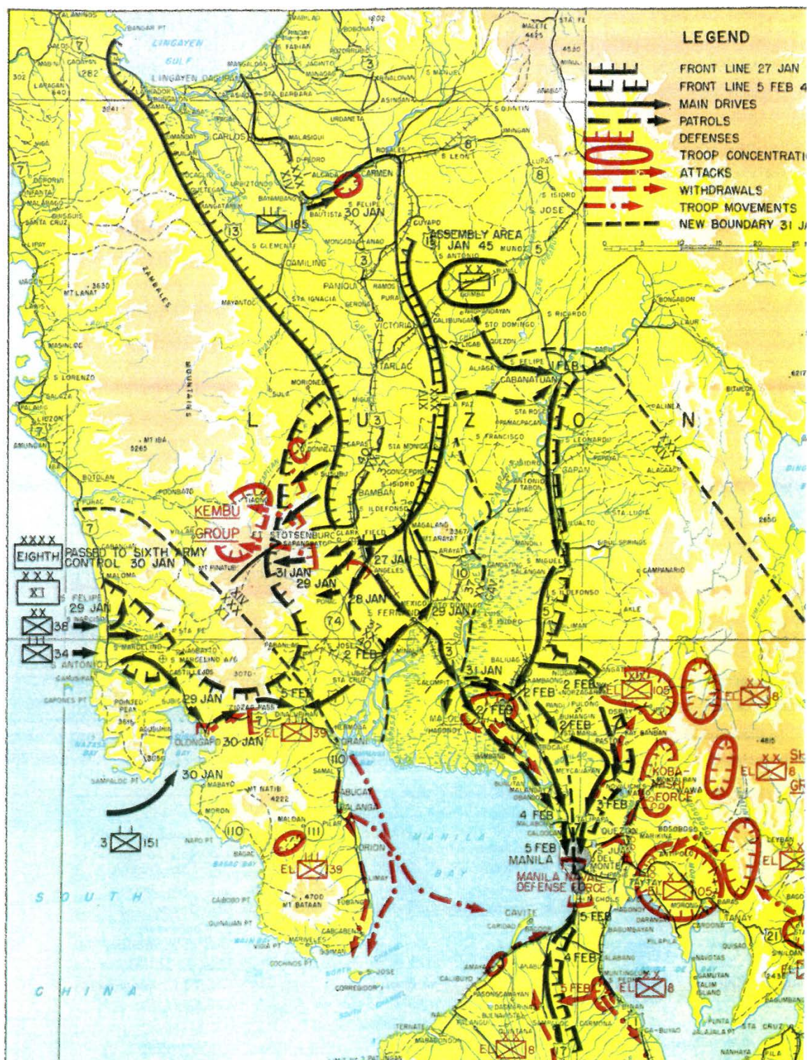
Figure 2. The Envelopment of Manila.

Source: Douglas MacArthur, Reports of General MacArthur (Washington, DC: Library of Congress, 1994), 268.