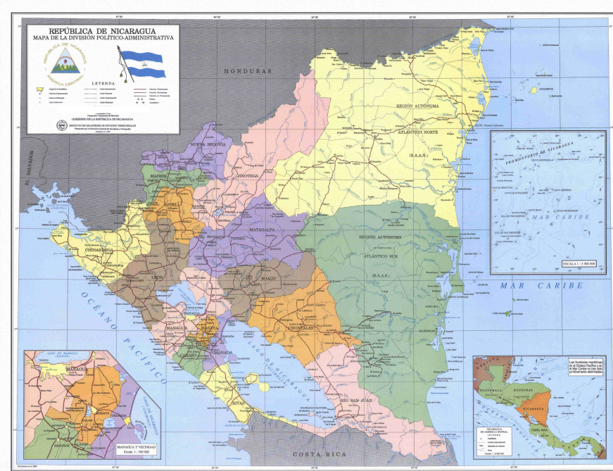
Figure 3. Map of Nicaragua 144

of 1958, the regime began to unravel, especially after Guevara’s guerrilla forces overran a large garrison in Santiago and met little resistance as the M-26-7 marched on Havana to seal their victory. By January 1959, Batista had fled the country and Fidel Castro seized power in Cuba with the overwhelming enthusiasm of the Cuban populace. 143