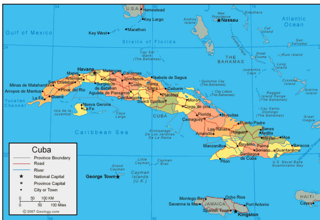
Figure 2. Map of Cuba 112

Before focusing on the particulars that led to the success of the Cuban and Nicaraguan revolutions, and allowing for a better grasp in terms of theory and life cycle covered in Chapter II, a thorough understanding of the permissive environment that allowed for these insurgencies to take root is required. This chapter will provide the historical background on both Cuba and Nicaragua in order to lay the foundations for which further examination can be accomplished. Specifically, it will cover the rise of both Fulgencio Batista in Cuba and the Somoza dynasty in Nicaragua. Additionally, it will explain how Fidel Castro's M-26-7 in Cuba and Carlos Fonseca's (among others) FSLN in Nicaragua developed and rose to power.