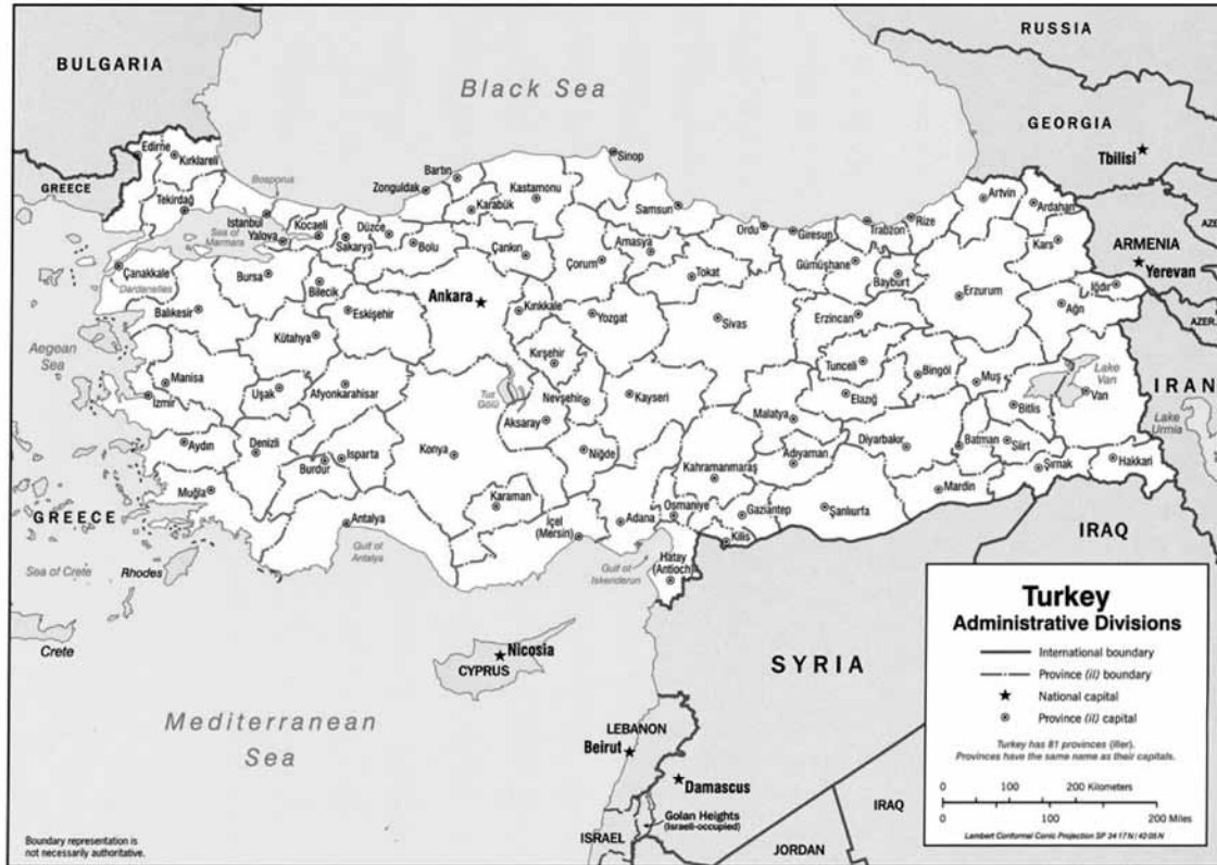
Map of Turkey.