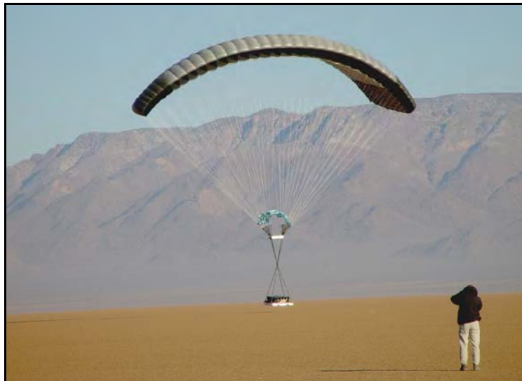
Figure 3. DRAGONFLY system just prior to ground impact in Kingman Arizona

The AGU connects to the parafoil risers and is suspended between the parafoil and the payload. The AGU currently weighs approximately 175-lb. The design has proven itself extremely rugged and robust through flight test. As with the parafoil design, great attention has been paid to minimization of unit cost. The AGU and its avionics suite rely heavily on the effective integration of commercial-off-the-shelf components. Primary system electromechanical subcomponents include: a pair of 1.5 hp brushed servomotors, motor controller, 54:1 gear reducers, 900Mhz RF modem, microprocessor, dual GPS, and three 12VDC sealed lead acid batteries. Two batteries provide 24VDC to the actuators, while the third battery provides power to the avionics.