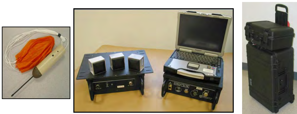
Figure 2. JPADS-MP Fly-Away Kit From Right to Left: Dropsonde, JPADS-MP HW & Laptop & Carrying Case

(PATCAD-2005, see Reference 4 for details on PATCAD-2003) and include at a minimum the following systems: Affordable Guided Airdrop System (AGAS), 2Klb and 10Klb SCREAMERS, Sherpas, and DRAGONFLY systems. The AGAS and Sherpa systems status are described in Reference 5 and 6 respectively.